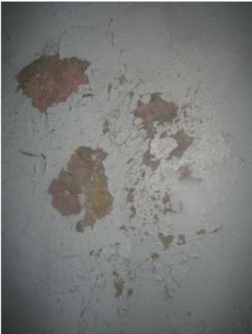
A modern, non-permeable emulsion paint flaking off lime plaster.

Limewashes – Although mainly associated with external work, limewashes have been used as interior coatings for centuries. Limewash is quicklime mixed in a water suspension (in a process called ‘slaking’). Additives were sometimes included to give a degree of protection against water penetration. Colour was provided by natural pigments. Only a limited range of materials were suitable due to the caustic (strong alkali) nature of the lime. Highly permeable, limewash was painted directly onto lime plaster or masonry. Limewash reflected light well; with the cured carbonate containing tiny refractive crystals which sent light out in different directions. Unless highly filtered and strained, limewash finishes provided an uneven, textured finish that can be appropriate for pre-18th century structures