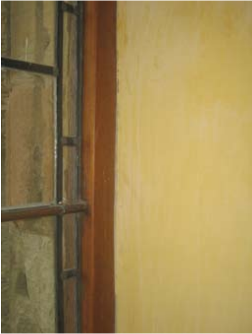
A traditional limewash finish