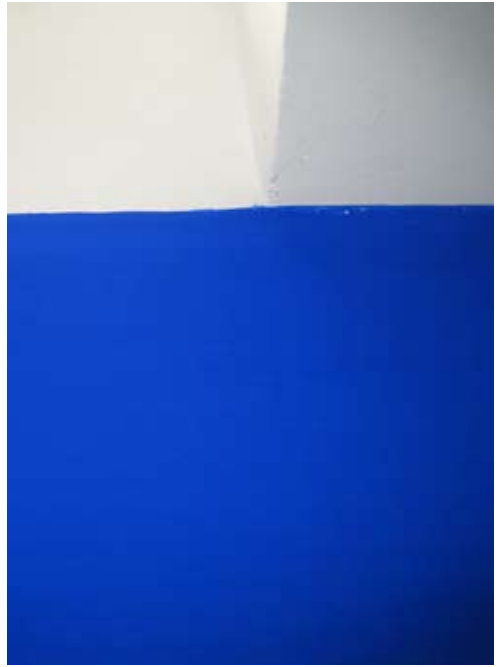
A strongly coloured distemper.

Due to its non-alkali composition, a larger variety of pigments were used in distemper than in limewash. However, the durability provided