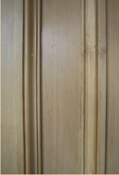
A traditional varnish finish on an early 20th pitch pine shutter.

Many properties now have their internal timber elements stripped bare. Historically this was not the case as bare wood was rarely seen. Where original varnished woodwork still exists it should be preserved. Such surfaces may have a little ‘crazing’ (cracking) on the surface but this is consistent with age and can be freshened up with a thin coat of Danish oil. While some may find dark finishes somewhat heavy-looking, the application of surface varnish or light stain (matching or a little darker than the wood) will seal the timber, assist cleaning, and be more in keeping with the original scheme. Obtaining an appropriate varnish to replicate dark Victorian woodwork is a matter of staining present day varnishes with the required tone.