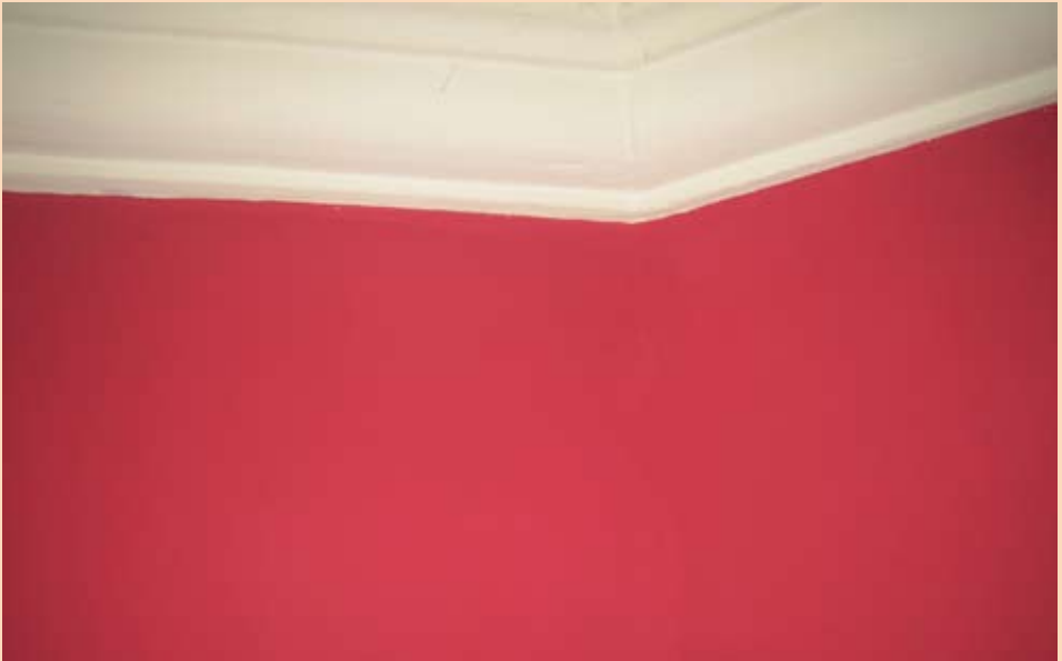
A soft, off-white distemper on the ceiling, with a stronger pigment for the walls.

powdered white lead). The paste was diluted with more oil and sometimes mixed with turpentine for ease of application. To speed up the hardening of the paint, additives called dryers were often added. Zinc sulphate was the most widely used. As today, surfaces were first primed, and one or more undercoats added in advance of the final coat. By the early 20th century, linseed oil was increasingly replaced by synthetic equivalents.