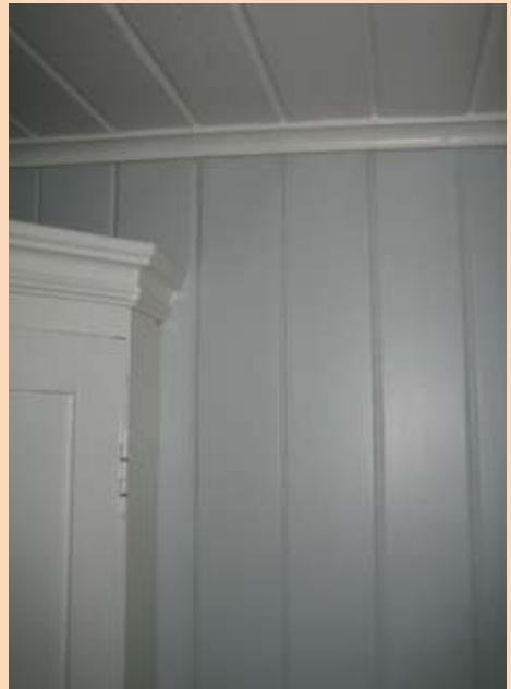
A traditional oil-based finish on timber surfaces.

Varnishes and stains – In the 18th century, most internal wooden surfaces were painted, or given a wood grain effect. By the 1850s a dark stain and varnish was frequently applied to elements of finishing joinery. This consisted of a linseed or walnut oil based stain (normally incorporating the natural pigments yellow ochre and burnt umber), and a clear varnish layer as a top seal. Boiled linseed oil, Danish oil and tung oil are the most natural modern alternatives.