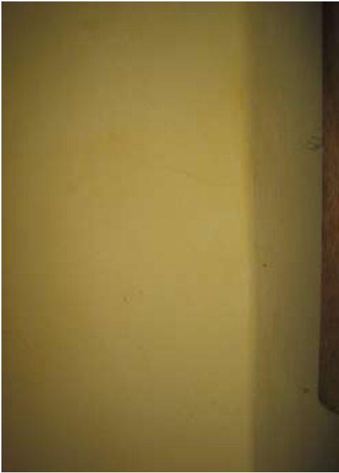
Limewash, coloured with yellow ochre.

(although this makes it unsuitable for classical or formal rooms). Limewash was largely superseded by the use of distemper in the 19th century.