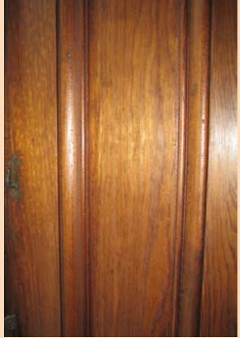
A traditional oil-based finish on timber surfaces.

It is always preferable to follow original historic paint schemes, and careful