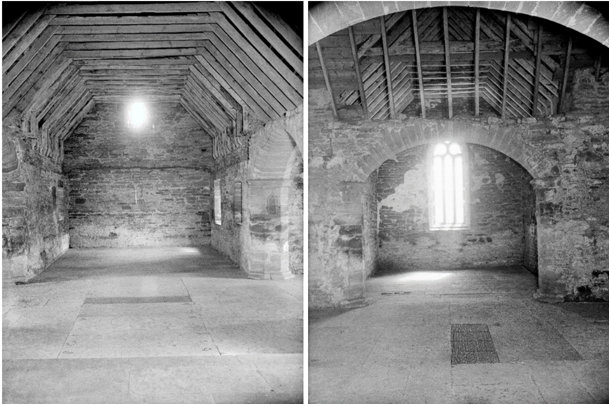
Figures 3a and 3b: 1951 images of interior, showing rafters, and arch to south transept.