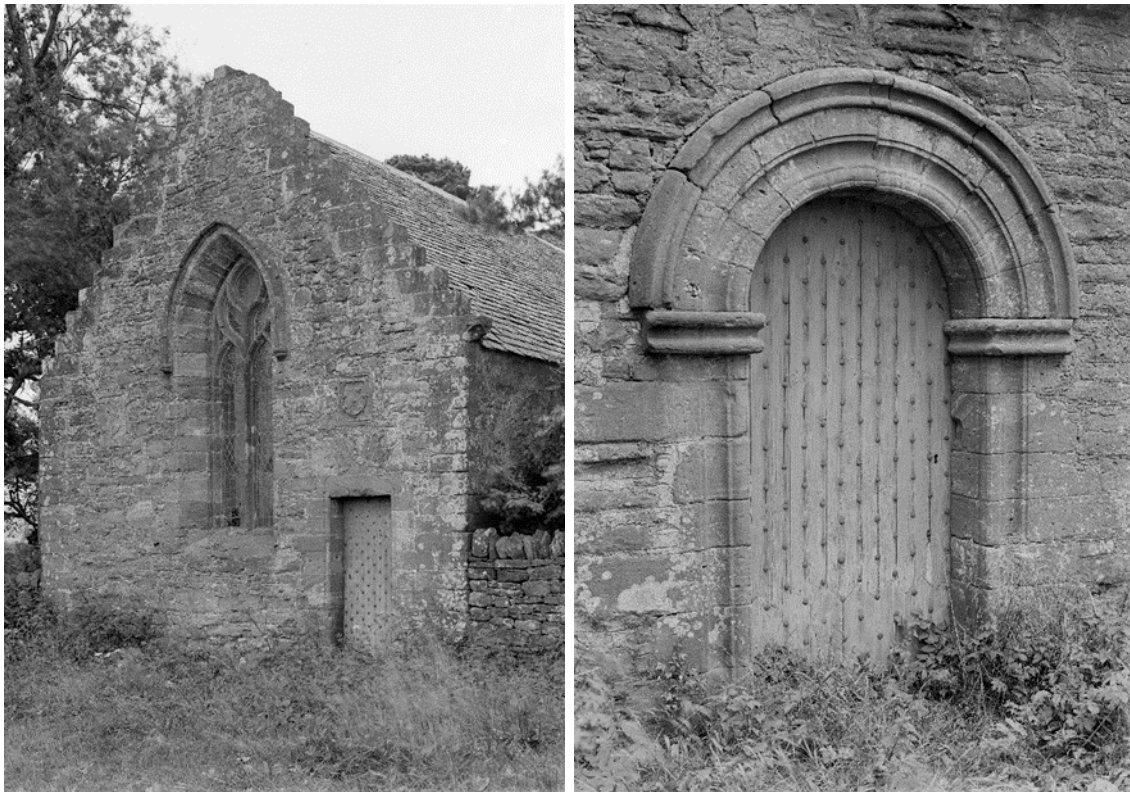
Figures 2a and 2b: Photographs from 1929. a) View of north transept gable, including window with uncusped loop tracery. b) View of round-headed south doorway.

values of the site are detailed at 2.4, and the following paragraphs outline particular aspects of evidential value