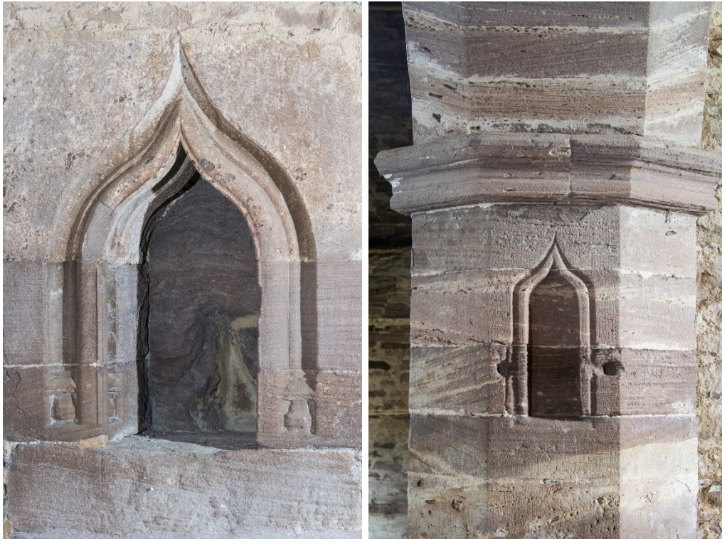
Figures 4a and 4b: Ogee-arched recesses in a) east end of south wall of chancel and b) east respond of south transeptal arch.

Faintly visible on the plaster fragments surviving on the south wall of the south transept is one of the twelve internal consecration crosses that would have been anointed with holy oils by the bishop when dedicating the chapel for worship. Towards the east end of the south wall of the chancel area is an ogee-arched recess that probably contained a piscina basin, in which the celebrating priest washed the sacred vessels and his hands at mass. Another ogee-arched recess is cut into the east respond of the arch that opens into the south transeptal chapel; it may have held a votive image associated with the adjacent altar. Holes in the masonry to each side of the recess suggest that whatever was within it was protected by a metal bar of some kind.