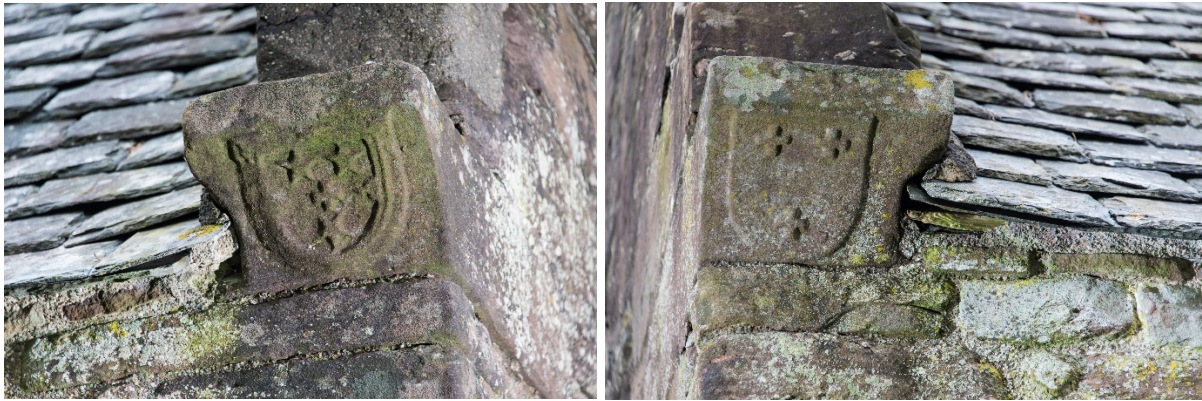
Figures 6a and 6b: Heraldry on skewputts of south gable: a) Sir Andrew's on west, b) Dame Margaret's on east.

between three stars within a double tressure flory counterflory. Dame Margaret's arms on the east skewputt are three crosses patty.)