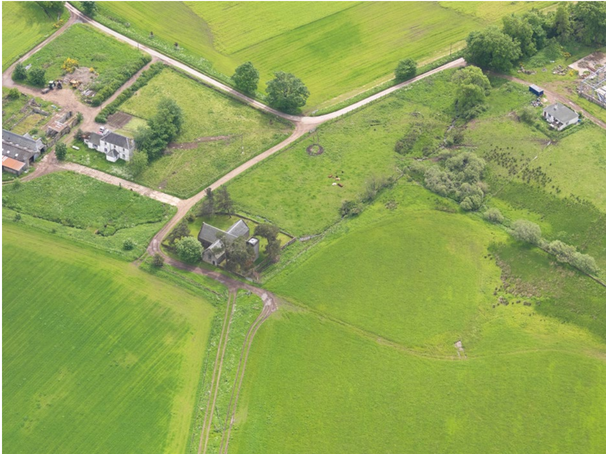
Figure 7: Aerial photograph of Tullibardine chapel, taken from the north-west.

The bedrock geology of the site belongs to the Dunblane Sandstone Member, with superficial deposits of Devensian Till.