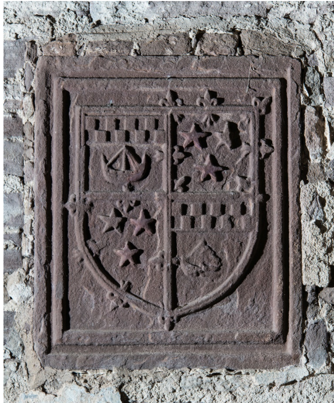
Figure 5: Quartered arms of Murray and Stewart of Innermeath.

The initial phase of construction is approximately dated by a number of re-set heraldic panels relating to Sir David Murray. 18 Set into the internal north wall of the chancel area are the quartered arms of Murray and Stewart of Innermeath (Figure 5), in reference to the marriage of Sir David's parents: another Sir David Murray and Isobel Stewart (three stars within a double tressure flory counterflory quartering a lymphad with a fess chequy in chief). Now located above the doorway in the north wall of the north transept is a panel with the family arms of Murray of Tullibardine (three stars within a double tressure flory counterflory). On the east side of the north transept window is a panel with the arms of arms of Murray impaling Colquhoun, in reference to the marriage of the chapel's builder to Margaret Colquhoun (three stars within a double tressure flory counterflory impaling a saltire engrailed within a bordure).