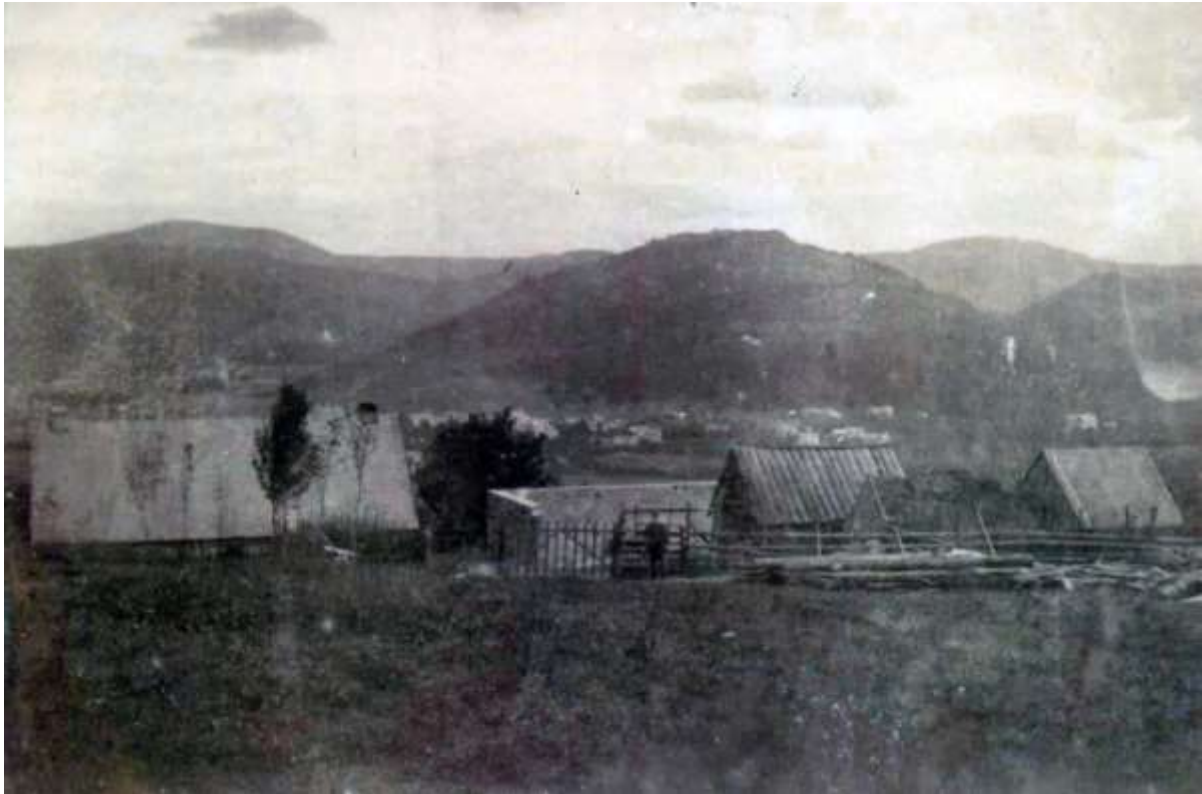
Figure 7. Downie's Cottage circa 1900. The later byre is under construction, here viewed middle foreground. Note the adjacent structures to the right which no longer survive.

This byre was probably used for cattle, as evidenced by a part cobbled floor, with hay probably stored in the roof space. Today only the masonry on three sides survives, as well as the concrete footings for some form of fixed machinery, possibly an oil engine for threshing. There were several other structures close by that can be seen in the early photographs, which no longer survive. What is of note with these smaller buildings is their roof coverings. Thatch and corrugated iron are well known in the highlands and elsewhere, but the images show what seems to be timber planks, laid vertically on the roof pitch (Figures 5 and 7).