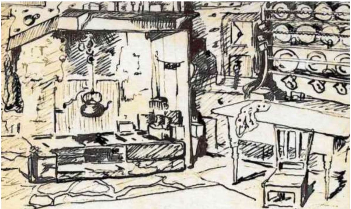
Figure 10. A sketch of the kitchen circa 1920, showing the main features still surviving today.

A family source was able to forward a sketch of the interior of the kitchen, done in approximately 1920, shortly before the cottage fell vacant. It shows many of the surviving features and some interesting domestic details of how the hearth was used (Figure 10).