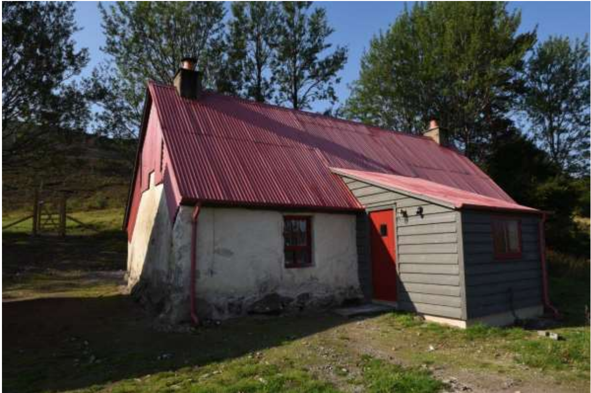
Figure 33. The croft house viewed from the southeast in September 2016 following completion of works in July of that year.

installed. The unique set of circumstances that made planning and design potentially problematic have been worked through and a most satisfactory result achieved, where the built and natural environments can co-exist. The accommodation, while small, has been maximised for use as a most attractive holiday let (Figure 33). The use of renewable energy and the energy efficiency upgrades have ensured that this small building, of proven durability and reliance, has a strong and sustainable future. Woven into this refurbishment has been an appreciation of the people who lived there and how such links connect us with a way of life that lies at some distance from our own.