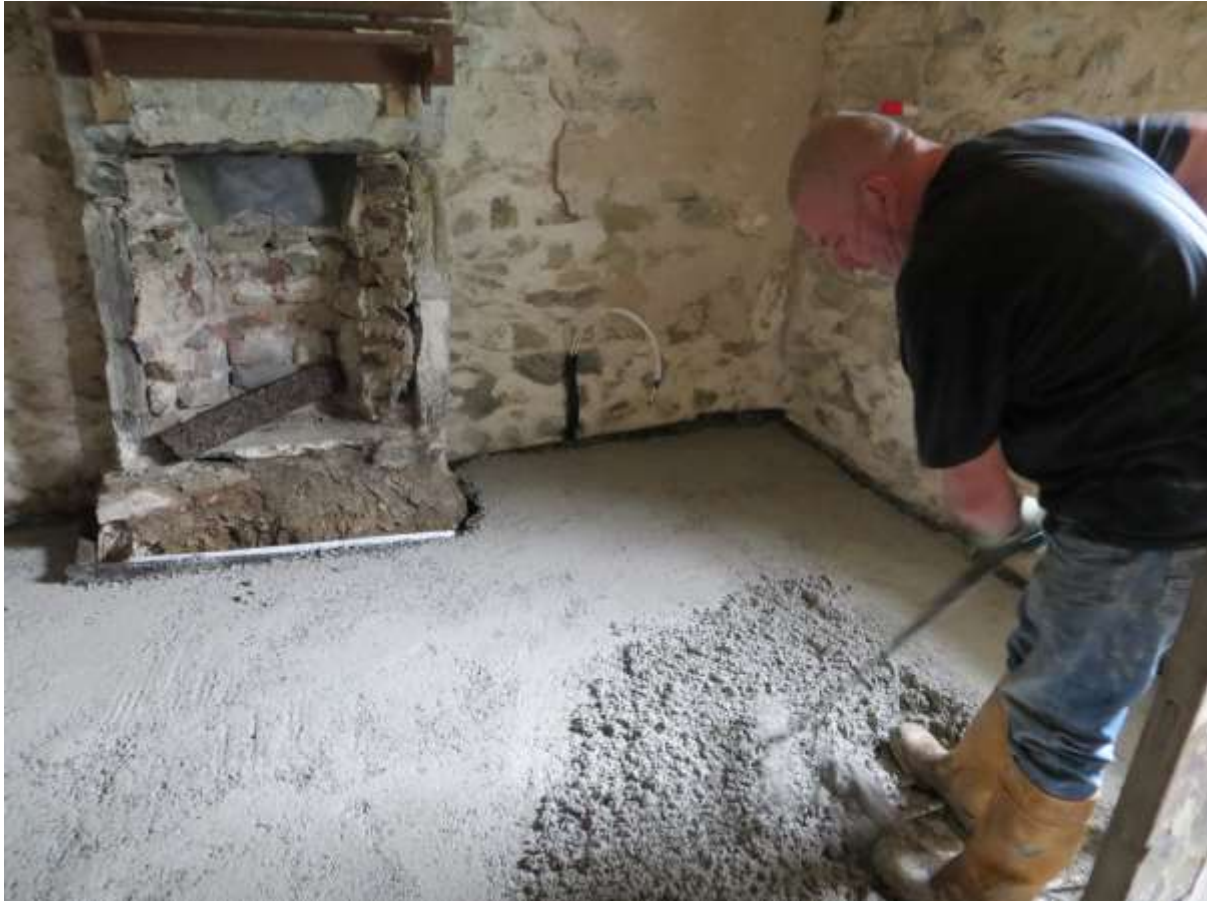
Figure 22. Laying the first lime concrete layer in the parlour. The final floor level was as the original at the height of the hearthstone.

An insulated lime concrete floor plate, designed for a heating loop, was laid in two layers to just below the final floor level (Figure 22). Level of the floor excavation was tapered up towards the walls to minimise excavation close to the wall foot. The floor consisted of an insulation layer of aggregate (expanded glass cobbles) overlaid with a geotextile membrane to provide a clean working surface, and enclosed with a 100mm lime concrete layer.