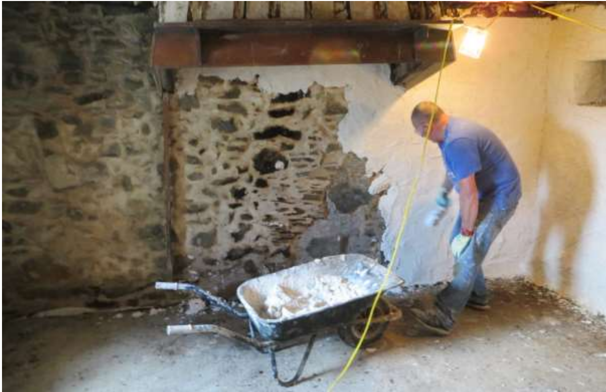
Figure 23. The first coat of insulated lime plaster being applied in the kitchen.

The original flagstones had all been removed and numbered to allow their replacement in identical order and these were then relayed over the lime concrete slab, giving a floor finish much like the original (Figure 24)