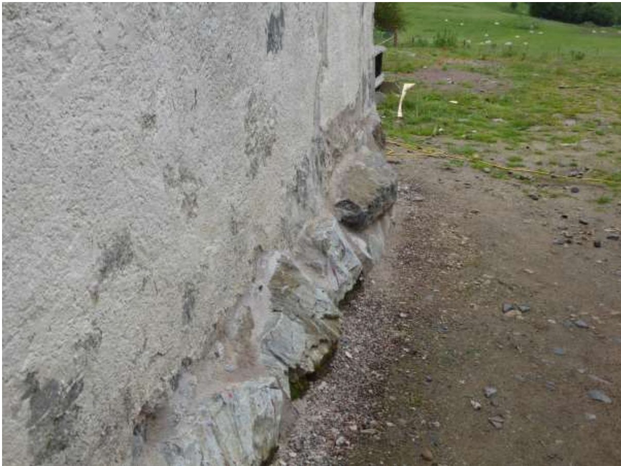
Figure 17. The foundation stones at the base of the wall.

Vernacular buildings of this type do not have foundations as they are understood today; the thickness of the walls increases the footprint and mean that the pressure on the ground is modest. Typically, to provide support to the fabric a base course of large stones is usually set into the ground, to a depth of a 300 mm (Figure 17), often a few inches wider than the above ground wall. However, at Downie's it was in places less. While this can be alarming to those from a modern construction background, it is generally sufficient. At the cottage, this base course occasionally touched bedrock and the walls were stable and in most areas the foundations required only simple re-pointing. However, the northwest corner was on a glacial gravel and there had been some settlement (the wall collapse at the southwest end was largely due to issues with the ditch and tree roots).