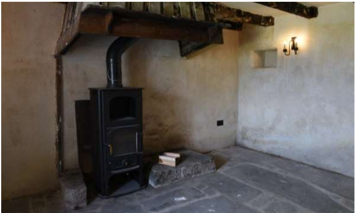
Figure 32. The new wood burning stove in the hearth below the hanging lum

The client also wanted to augment the under floor heating with a wood burning stove that could raise the temperature quickly in the kitchen if required. This was located in the kitchen, on the footprint of the hearth below the hanging lum (Figure 32). A modern double skinned flue was fitted within the existing timber of the hanging lum. This allowed the safe use of a fire in the building.