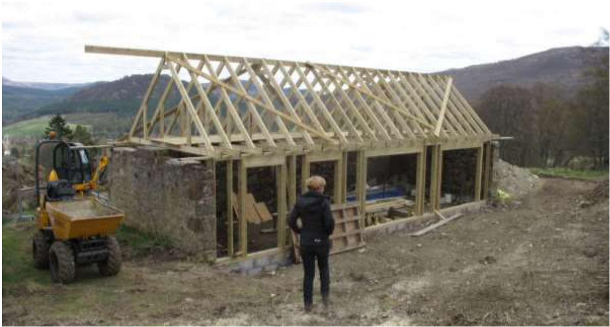
Figure 15. The new roof structure on the byre.