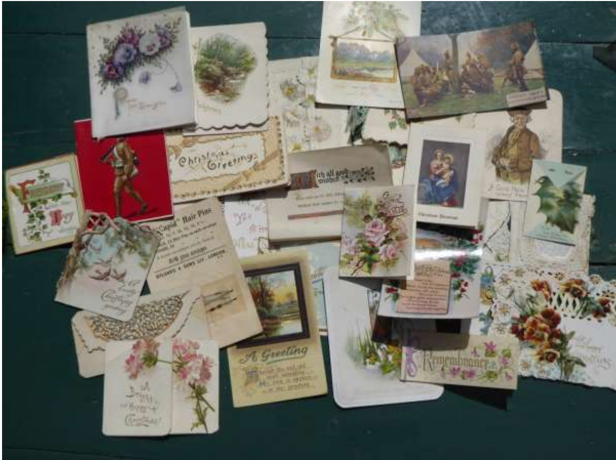
Figure 8. Victorian greeting cards and other items found in the upper floor during the tidy up.