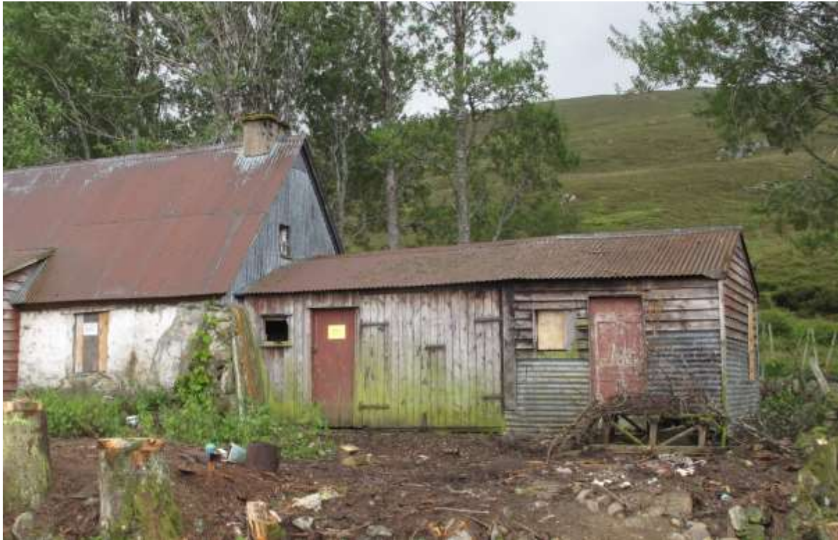
Figure 6. The store room on the west side of the croft house.

With older structures it is important to note that in many cases it is not just the building itself that is of importance, but the ancillary features and structures that give the building its context and contribute to the wider story. In the case of the croft house, there are several associated structures that, whilst not of any antiquity, are of note. Built against the west gable is a low shed (known as the store room) with a pitched corrugated iron roof, informally constructed for agricultural use (Figure 6). From the timber pieces used it probably dates from around 1930.