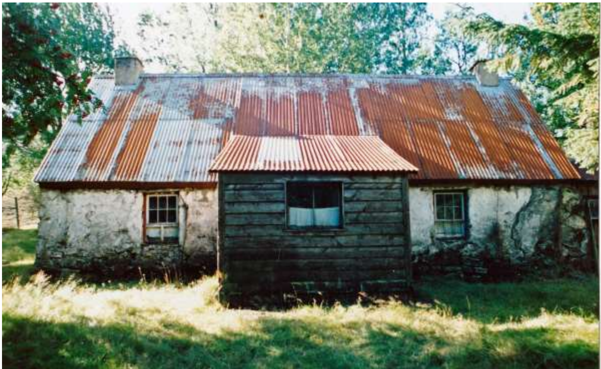
The cottage in the 1990's.