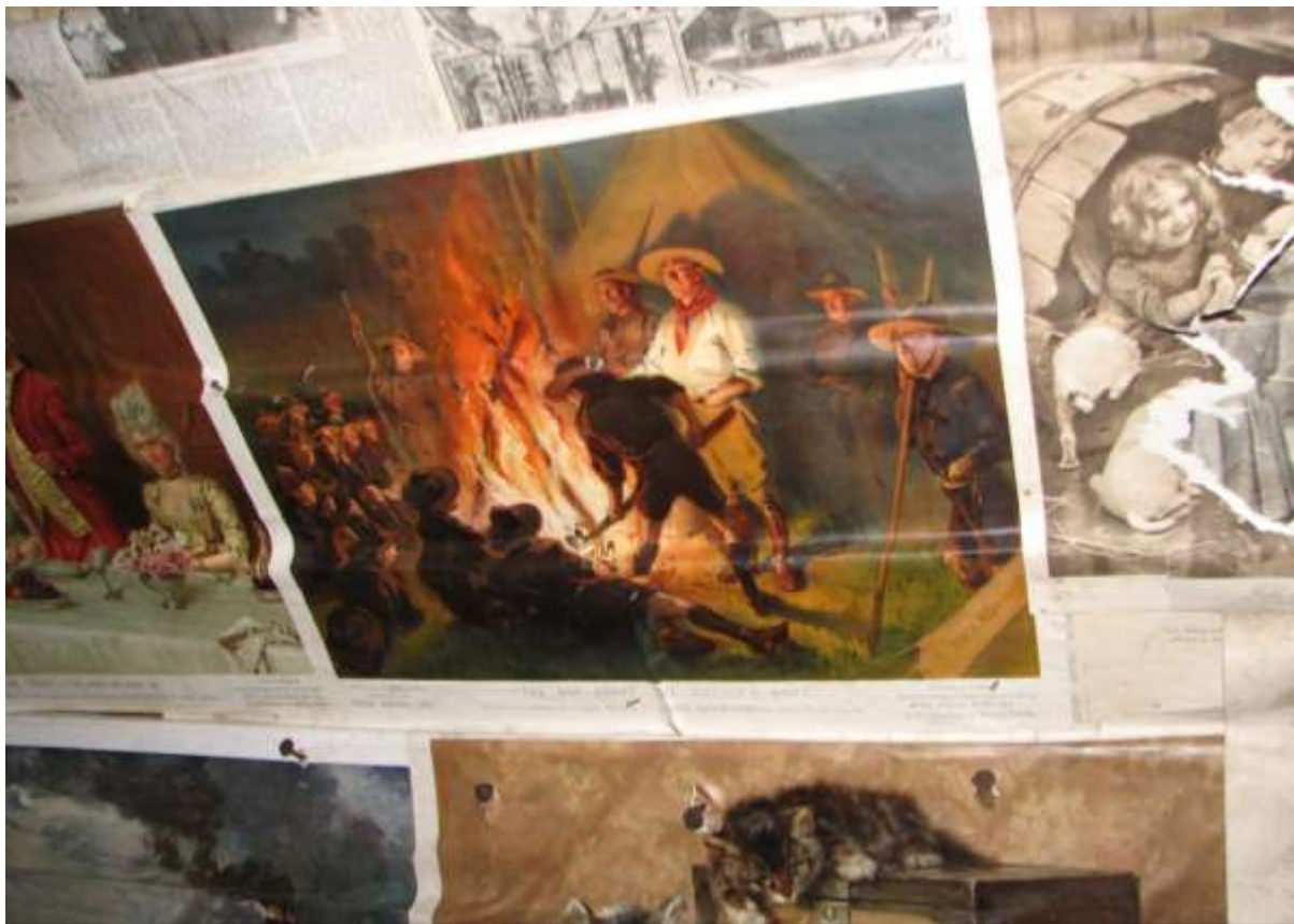
Cuttings and images from the 'Illustrated London News' used as internal wall coverings at stairwell partition