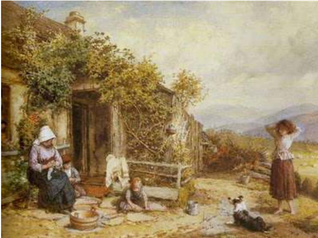
Figure 2. A late-19 th century watercolour showing the porch of Downies Cottage painted by Miles Birket-Foster.