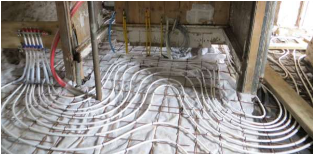
Figure 31. The heating coil fixed in place prior to the final lime concrete layer.

The underfloor heating matrix for the ground source heat pump was fixed to steel reinforcing mesh as the proprietary fixings supplied would not sit accurately on the lime concrete insulation layer (Figure 31). A smooth lime concrete floor slab was then laid encapsulating the heating coils.