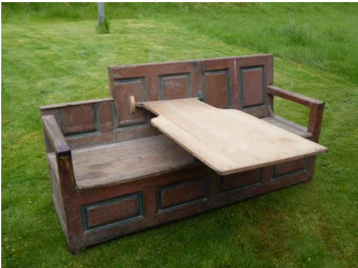
Figure 12. The 'deas' referred to by Nan Shepherd, returned to the bothy after some time away.

A 'deas' (or deece) is a piece of traditional Scottish furniture resembling a bench with a folding table attached. This item remained in the house but was known to have been relocated and used locally after James MacGregor's death, but was returned to the bothy when repair works started (Figure 12). The Tomintoul example is well made with moulded panels and tenon joints of a high standard; the folding table, while clearly old, does not appear to be original. The cut-away corner on the left hand side was made to allow it to fit against the kitchen window.