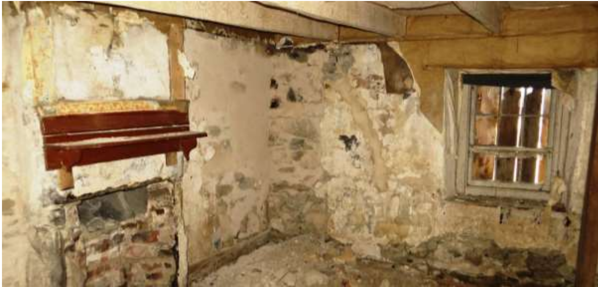
Figure 20. Completed re-pointing work in the parlour.