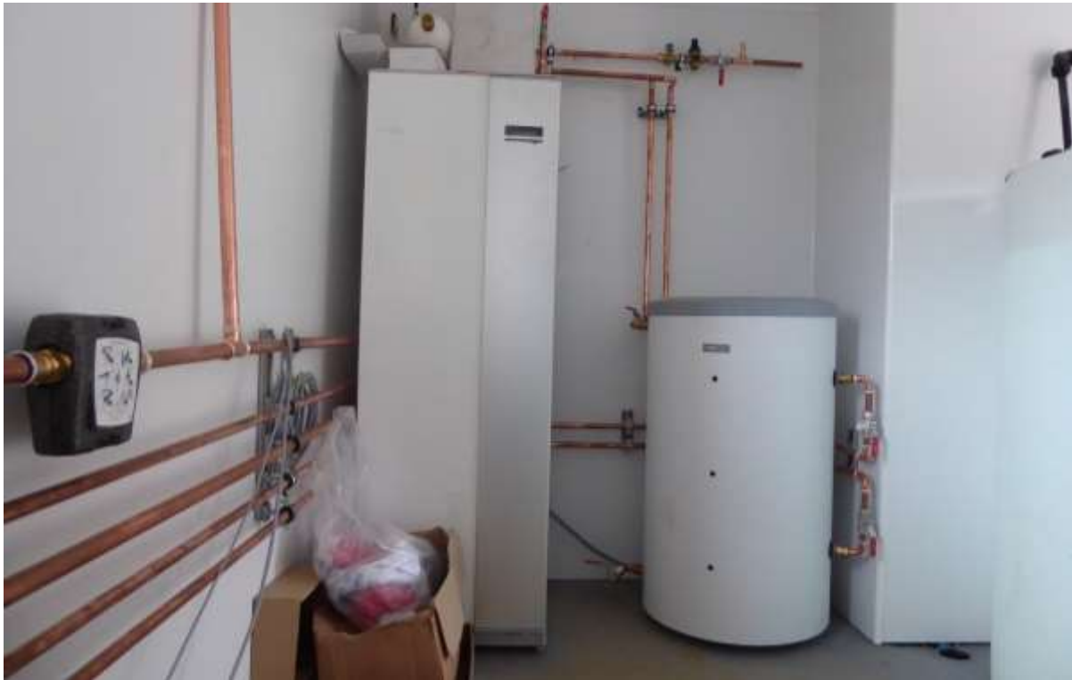
Figure 29. The heat exchanger and other equipment in the restored byre.

were dug in the field to the north east of the croft house (Figure 30). In some circumstances there will be considerations regarding buried archaeological remains; an assessment of the site indicated that this was most unlikely. In this instance, nothing was encountered.