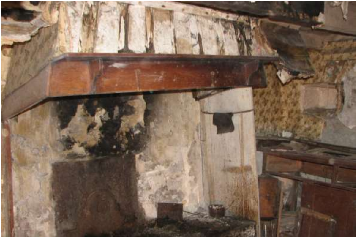
Figure 9. The hanging lum in the kitchen prior to works; a very rare survivor of a once common feature in rural homes.

A family source was able to forward a sketch of the interior of the kitchen, done in approximately 1920, shortly before the cottage fell vacant. It shows many of the surviving features and some interesting domestic details of how the hearth was used (Figure 10).