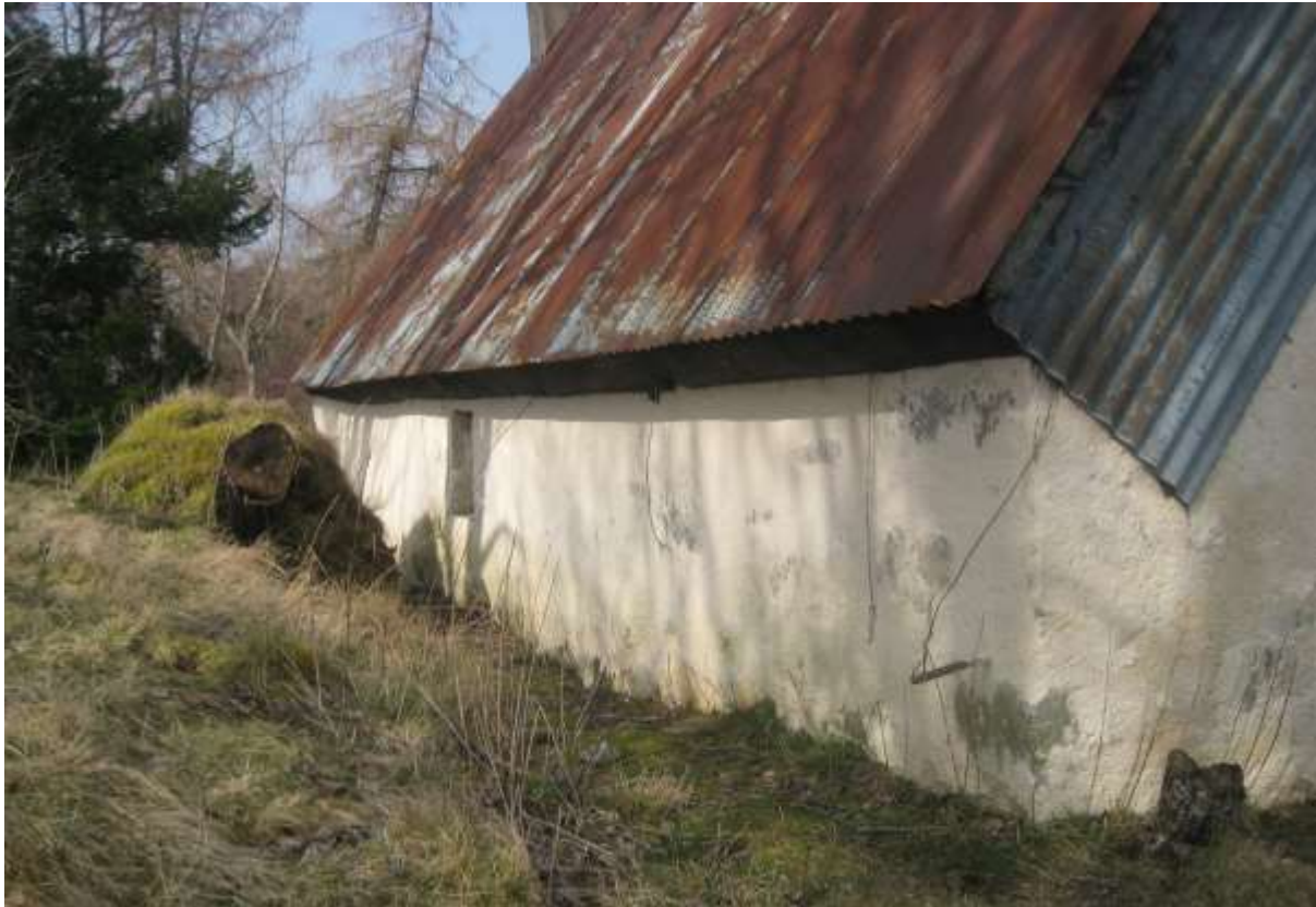
Figure 19. Completed limewash on the partly re-built south wall.