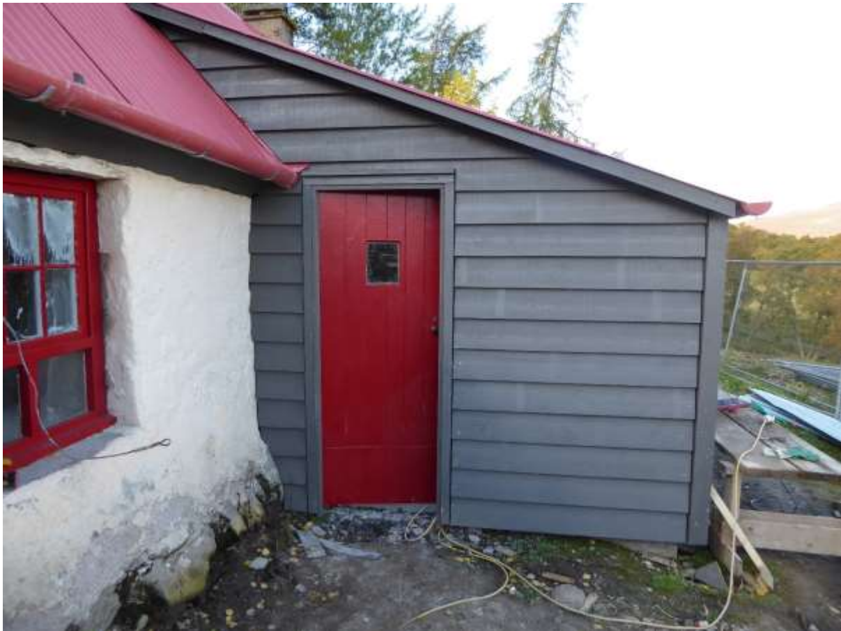
Figure 28. The rebuilt porch, on the original footings and to the same profile, which became the kitchen.

Wood fibre-board was fitted between the new framing to provide insulation, and new larch boarding was fastened to the exterior in the same manner as the original.