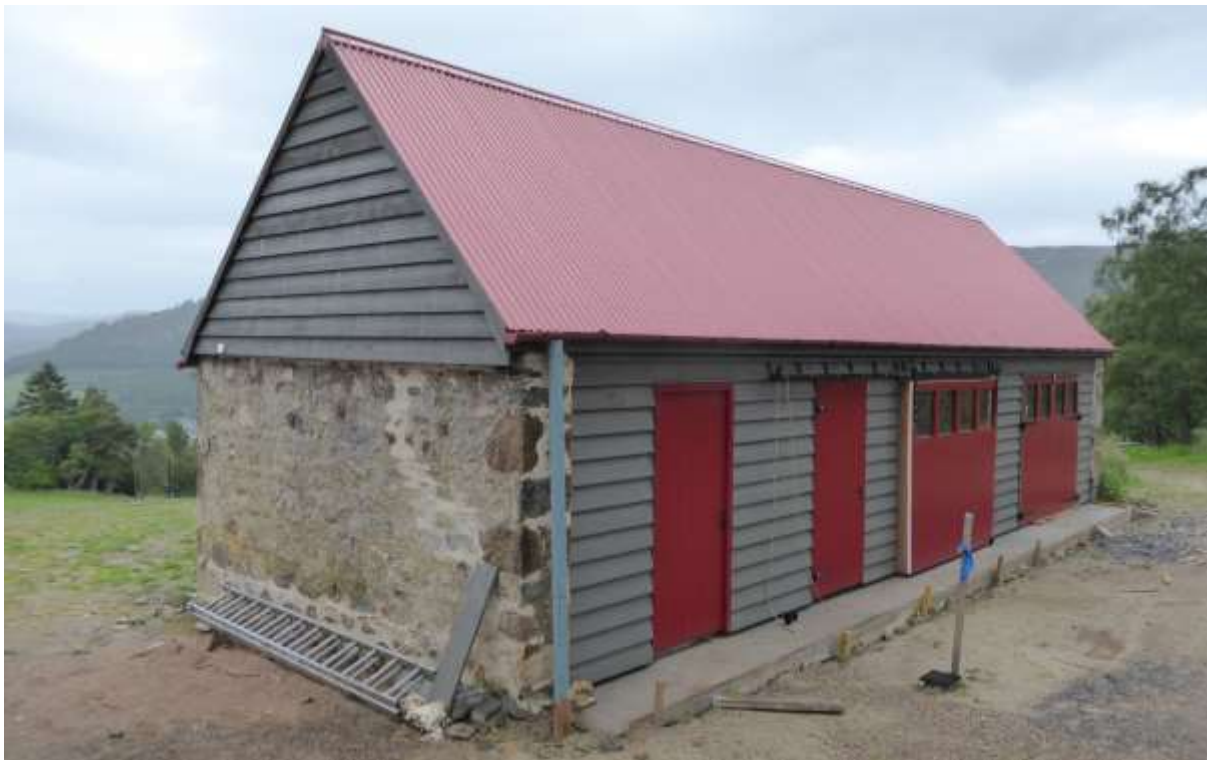
Figure 16. The restored byre with new doors and roof, blending in well with adjacent structures.

The byre had always been open to the south for the storage of agricultural equipment, but as an enclosed space was required a new timber front was designed, with large opening doors. The design and construction was simple and easily assembled, using standard timber lengths and fastenings. This gave a useful enclosed space that was entirely consistent in spirit to the croft house, and to other buildings in the vicinity (Figure 16).