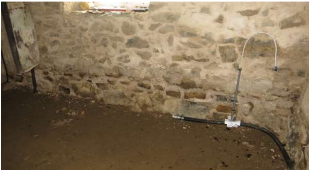
Figure 21. New masonry consolidation on the wall footings following the excavation of the floor.

An underfloor heating system supplied from a ground source heat pump was specified. This required the removal of the existing flagstones and the excavation of the floor, down to a depth of 400mm below the floor level. Part of this depth was required by the client to increase the room height. This was done by hand, and material was transported out in wheelbarrows. The depth of the excavation caused some apprehension for the contractor, fearing masonry movement due to removal of material at the base of the wall. In practice, for short periods (hours) exposing short lengths of wall in good condition on one side did not lead to issues. It was decided to excavate the floor in short sections (Figure 21), and additional masonry was built into the exposed footings of the wall.