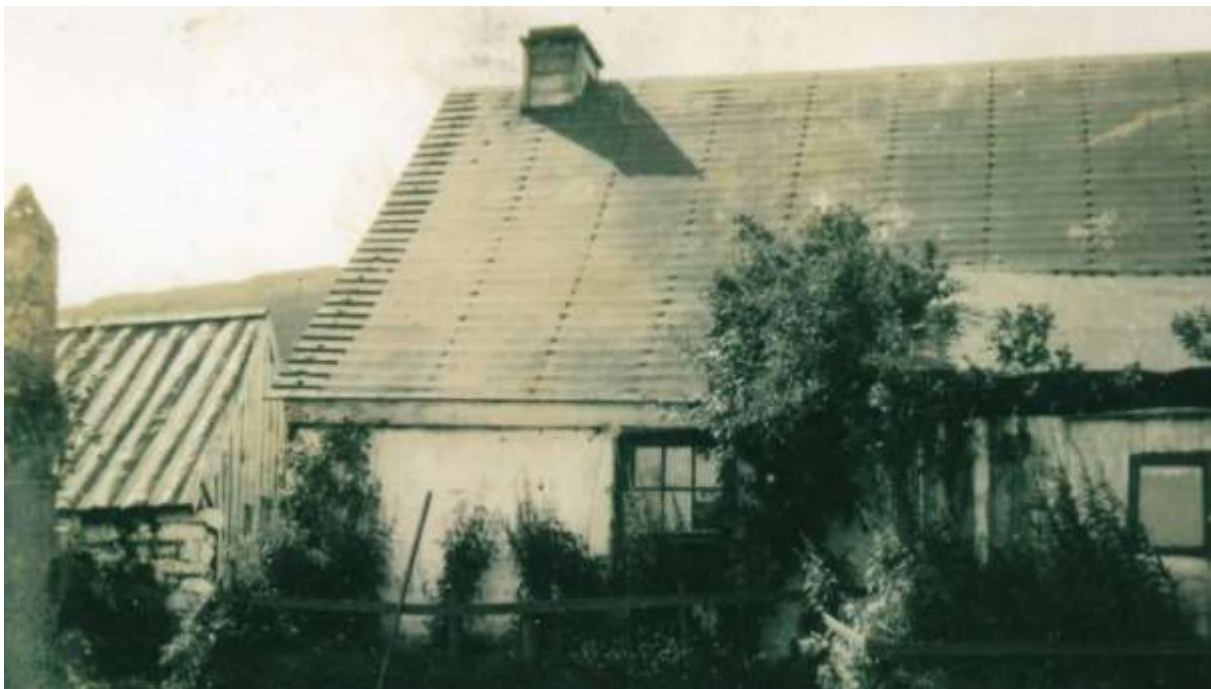
Figure 5. The croft house viewed from the north in the late 19 th century, showing the timber plank roof covering protecting the thatch. Note the steading to the left roofed with vertically laid sawn planks.

The corrugated iron would appear to be of a relatively recent date but this additional protection for the thatch was preceded by another protective layer - horizontally laid timber planks, shown clearly in an early image (Figure 5). Interestingly, these planks seem to have also been covered with a form of material, possibly a tar or bitumen painted canvas.