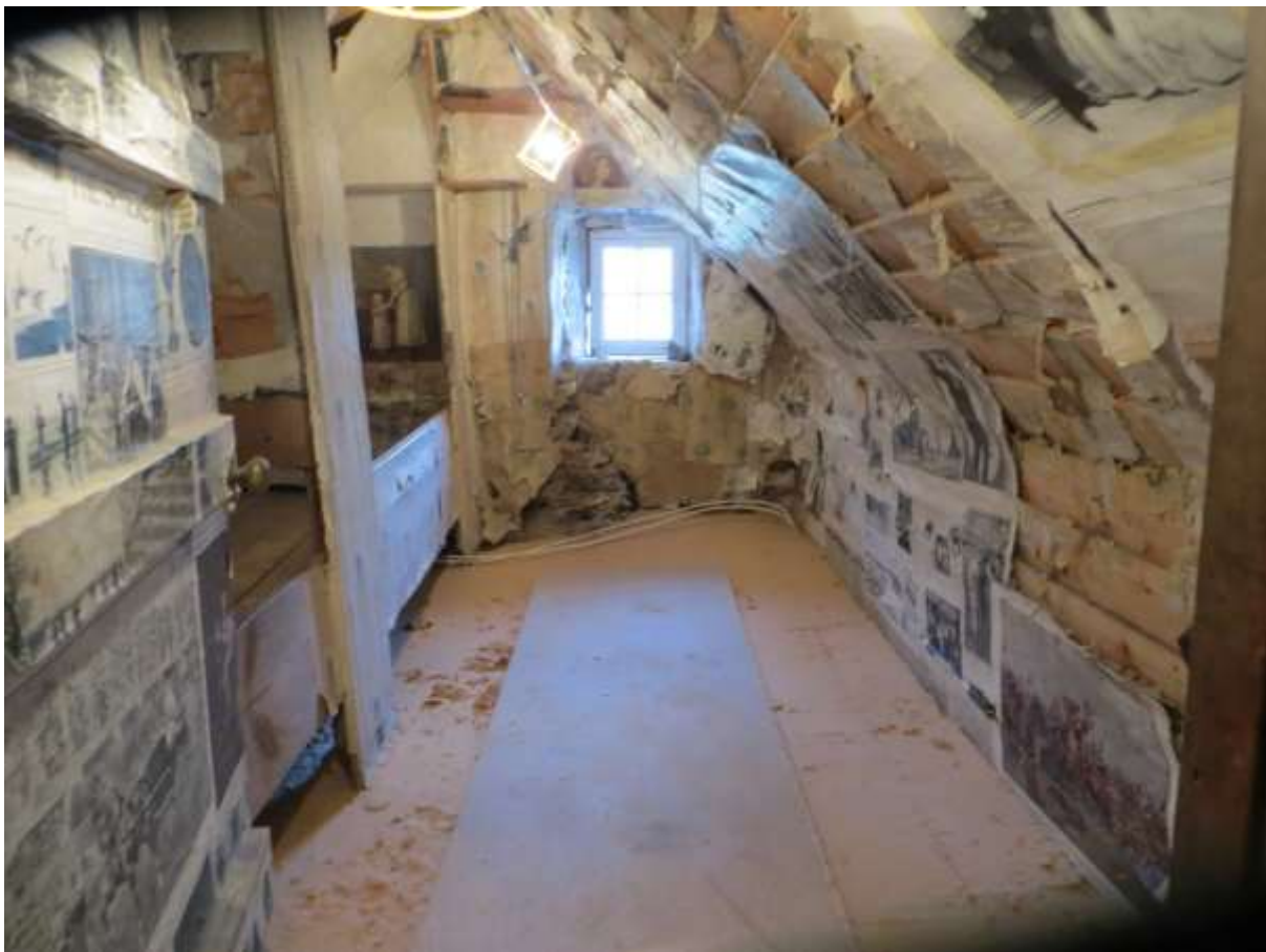
Figure 26. Wood fibre insulation laid on top of the floor in the attic rooms.

This area of the building was largely left as it was to be used for storage. A layer of wood fibre insulation was laid on top of the existing floor (Figure 26) to give a thermal break between the inhabited floors below and the cooler space above. The existing lapped boards, with their covering of paper illustrations, were left in situ. The door giving access to the stair was repaired and used to close off the attic.