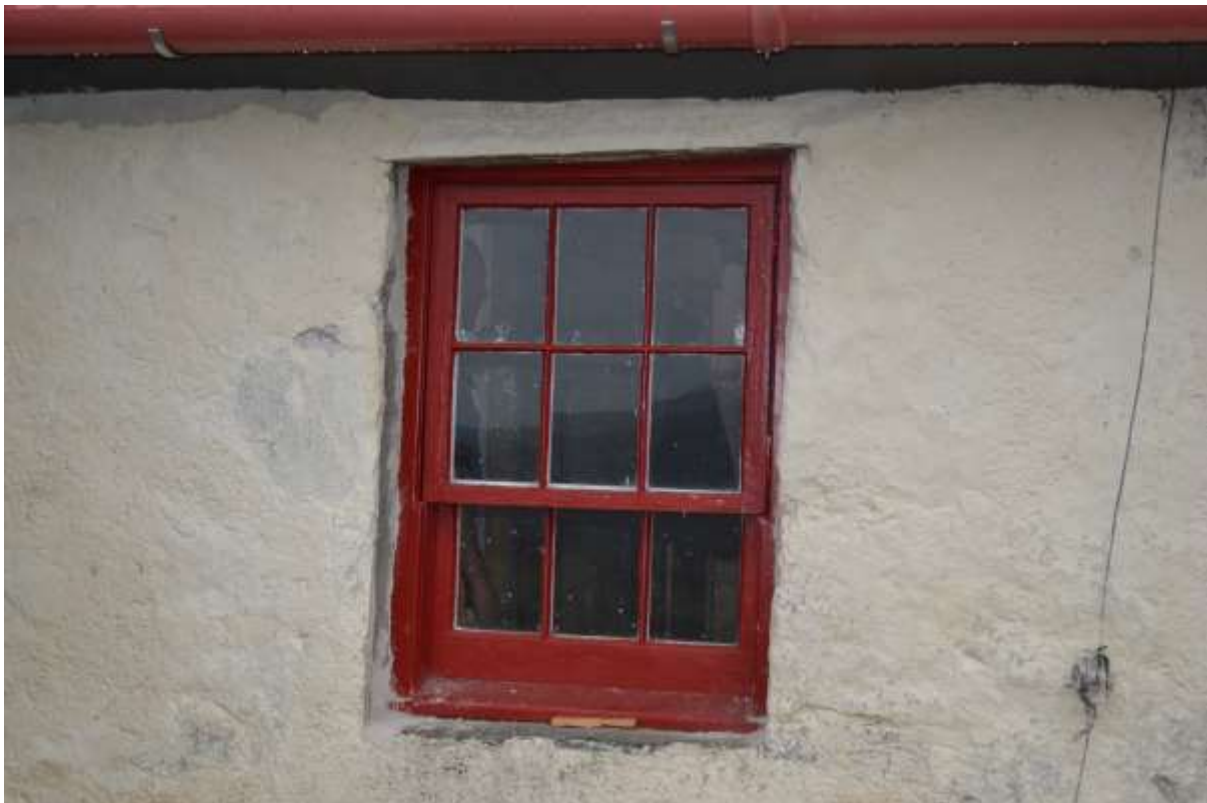
Figure 27. The repaired parlour window, following adjustment for use as a fire escape.

In order to comply with Building Control requirements to ensure that the building could be evacuated via the windows in case of fire in the porch, the upper sashes had to be adapted to form casements; this require Listed Building Consent.