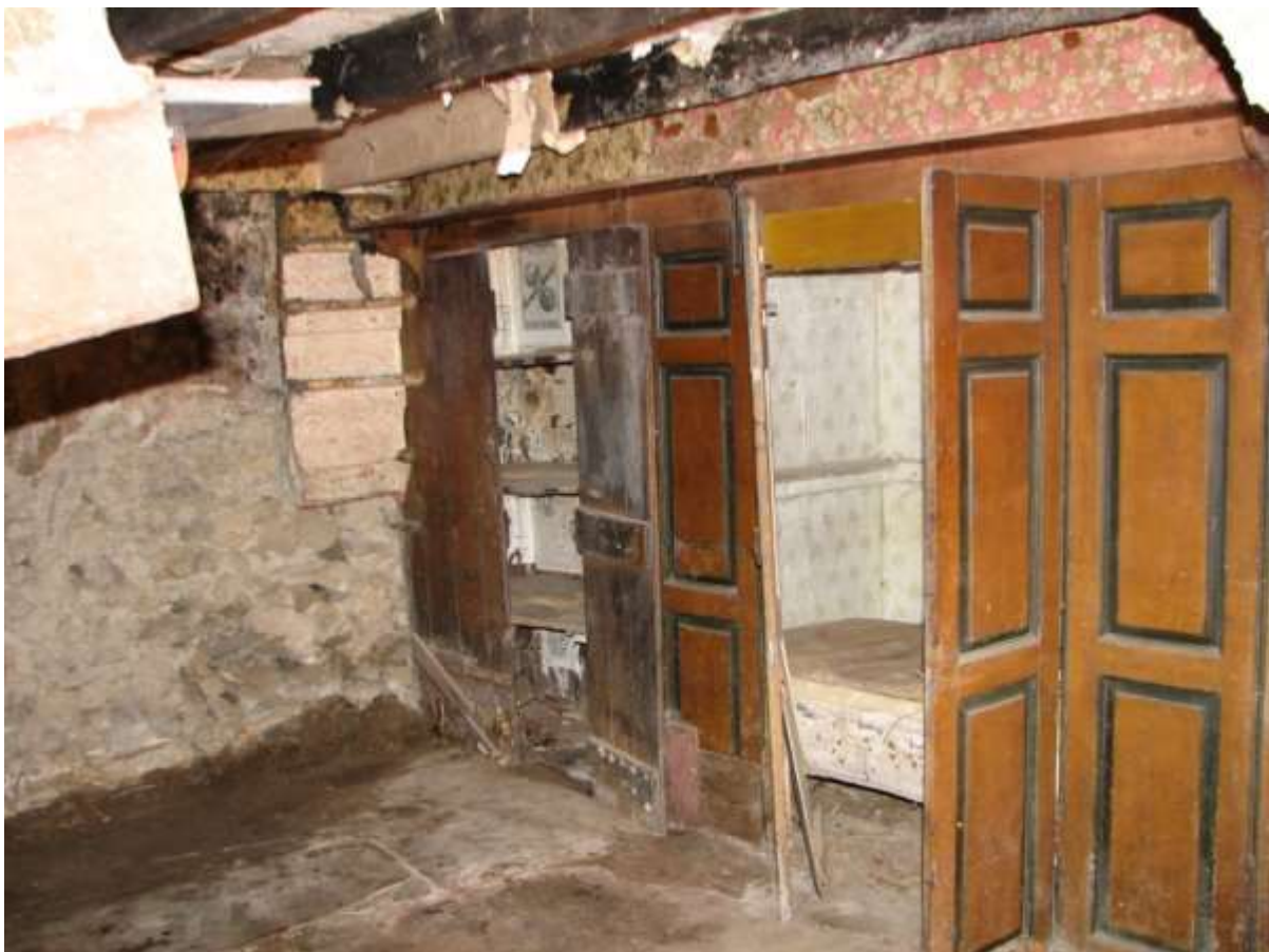
Figure 11. The box bed in the kitchen. Note the straw filled mattress just visible through the open shutter leaf.

Box beds were common in rural and urban dwellings, including tenements, until the early 20 th century. They provided a compact and neat sleeping space and, in this case, the closing leaves allowed a degree of privacy. The straw filled mattress was still in place, though not usable (Figure 11).