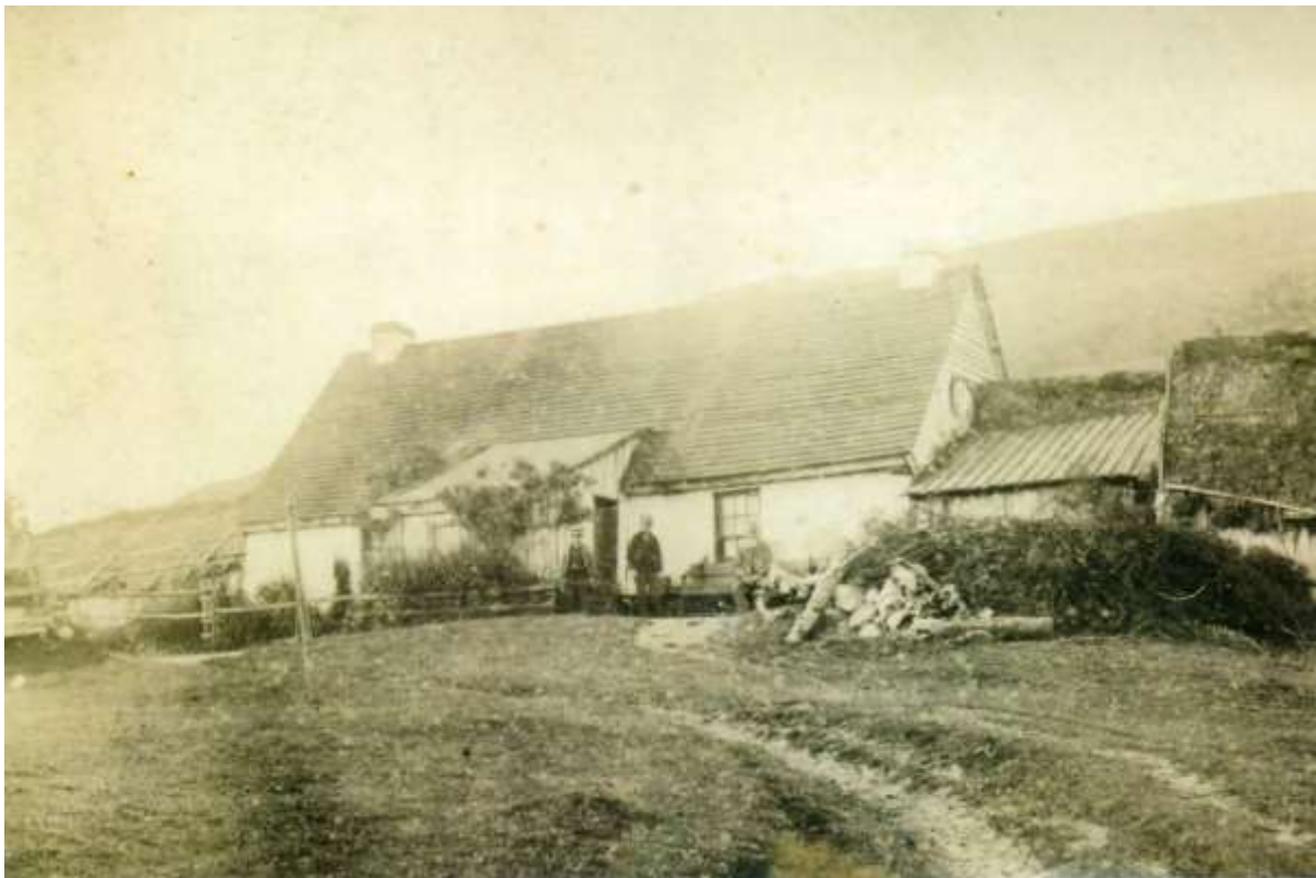
Figure 1. The cottage in the late-19 th century, viewed from the north west.

The building is hard to date accurately, but it is likely to have been in its present form by the mid-19 th century, with the final feature being the later addition of a small lean-to porch, all of which is shown clearly in a late 19 th century image (Figure 1).