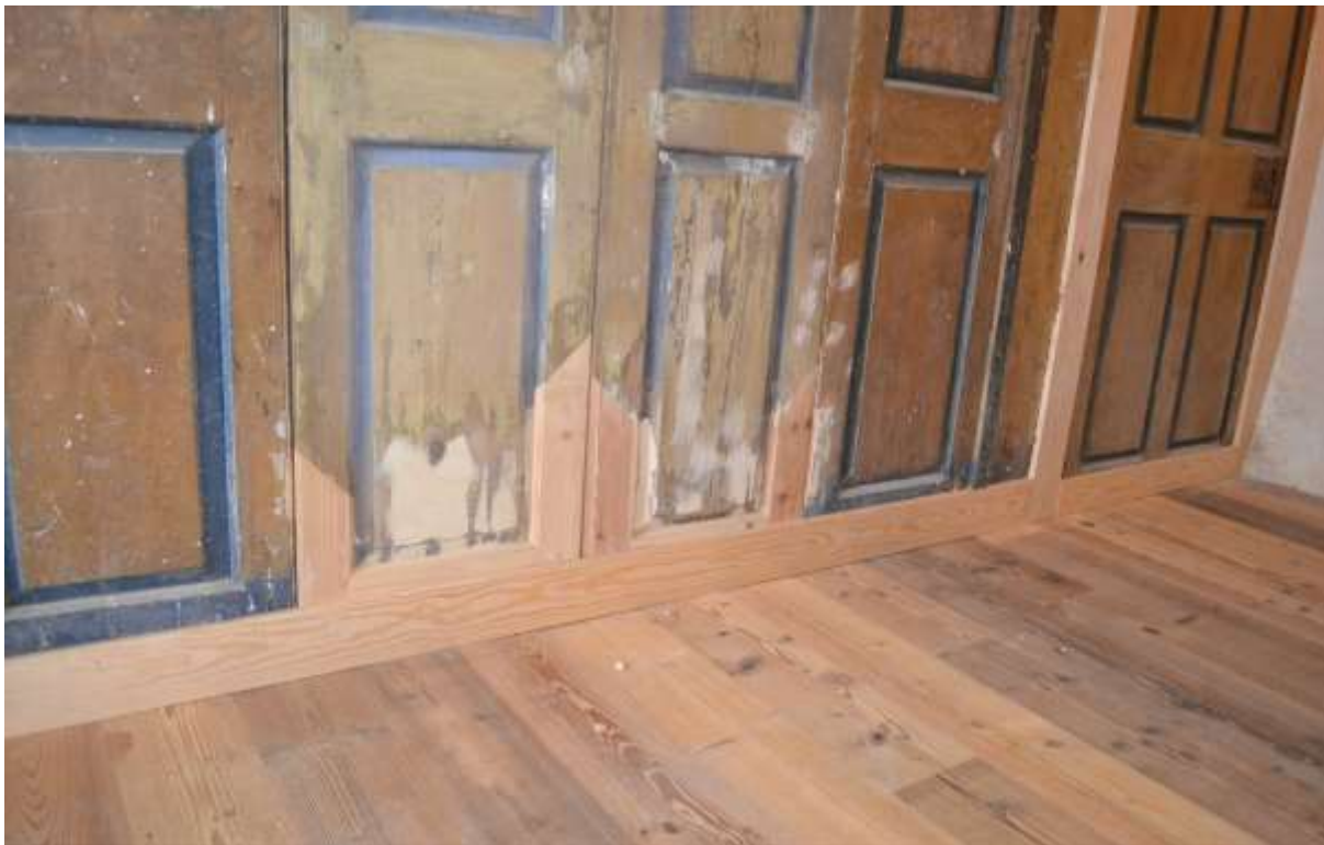
Figure 25. The new timber floor and the repaired box bed panelling in the west bedroom.

The original flagstone floor was only present in the kitchen and hallway, whilst the remainder of the ground floor had a timber floor, although as previously noted this had largely rotted away. In order to replicate the original floor finishes, the area of the previously timbered floors was made up with timber battens set into a lime concrete screed to allow fixing of replacement timber flooring. In order to ensure that the new timber flooring is unaffected by the underfloor heating, an engineered board was specified which comprised a softwood wearing-course bonded to a plywood tongue-and-grooved base which was fixed to the timber battens (Figure 25).