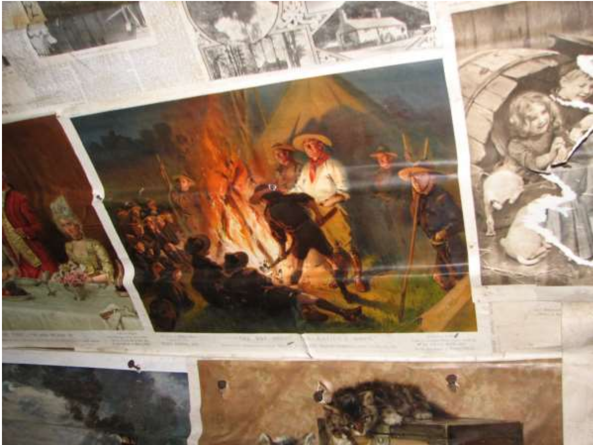
Figure 13. The wall coverings on the stairwell partition; their survival is unusual.