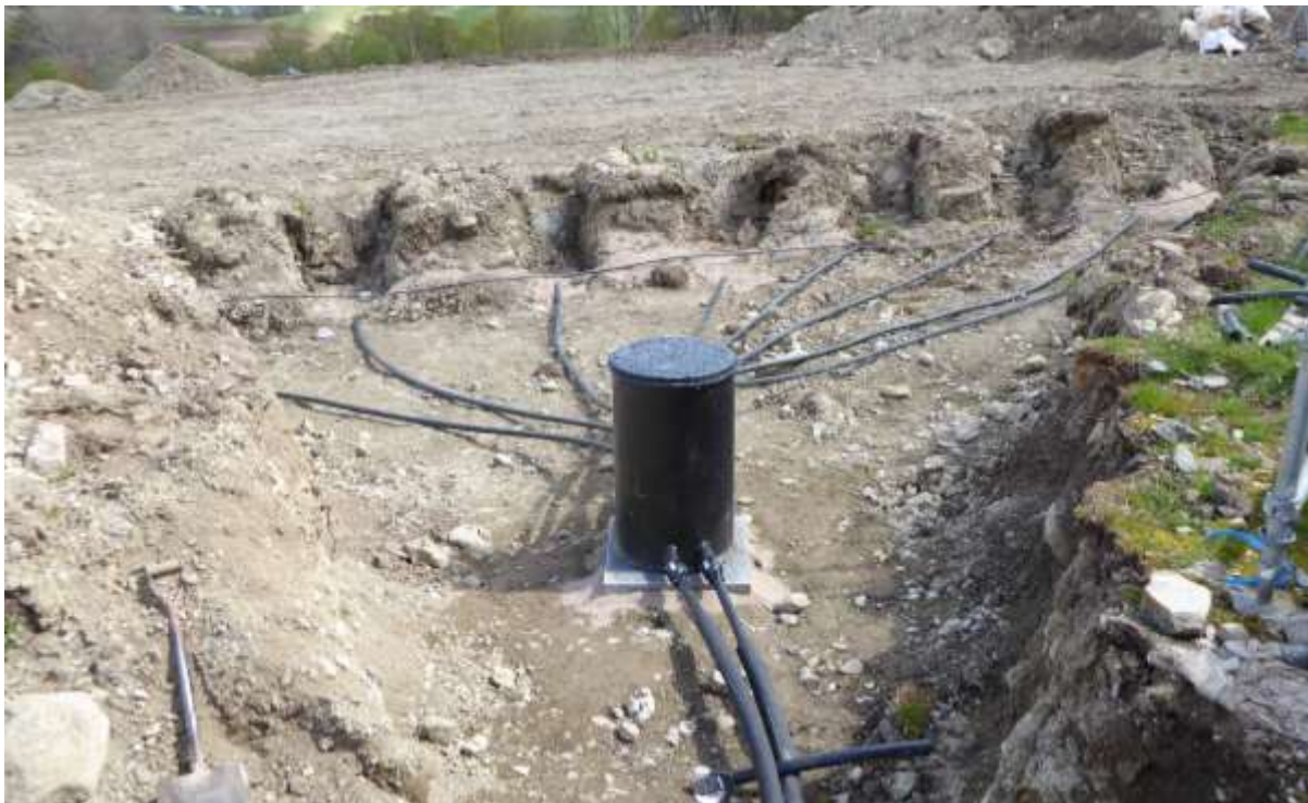
Figure 30. The junction or collector for the ground source heat pump coils laid in the field to the north east of the croft house.