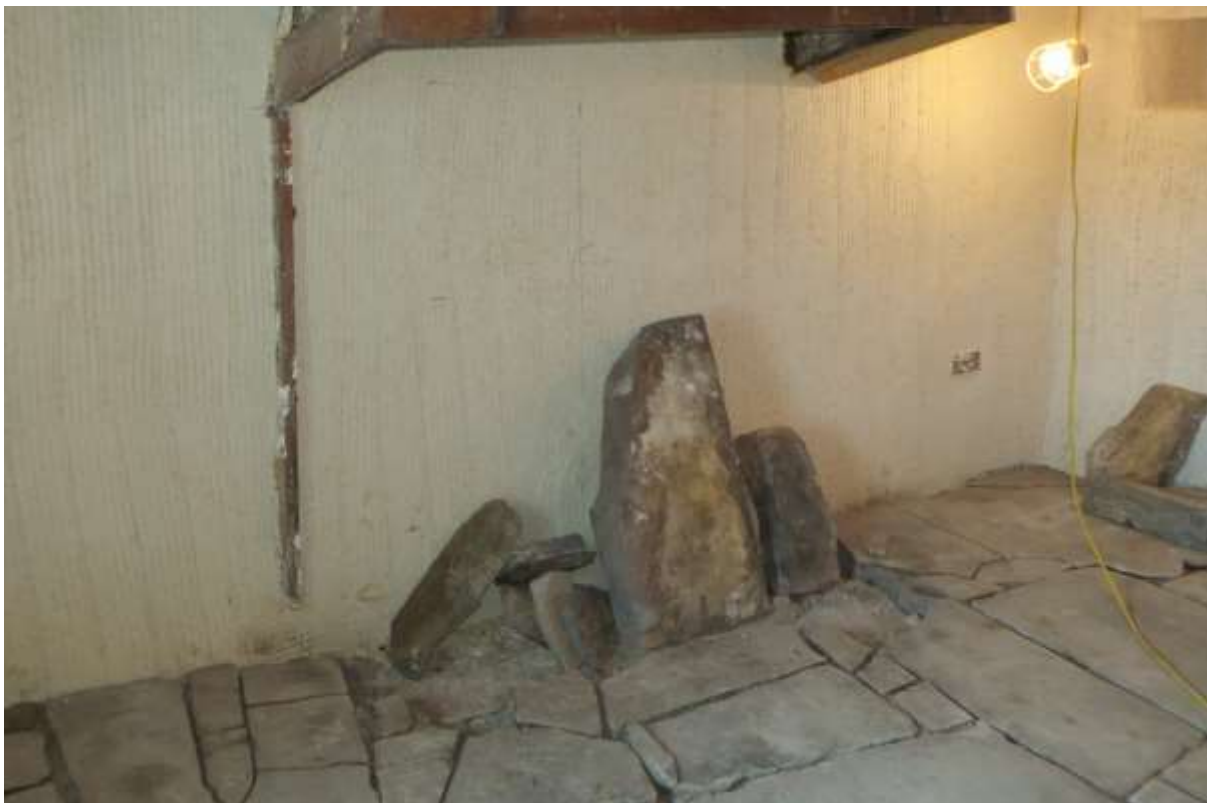
Figure 24. Re-laying the flagstones in the kitchen onto the insulated lime concrete.

The original flagstones had all been removed and numbered to allow their replacement in identical order and these were then relayed over the lime concrete slab, giving a floor finish much like the original (Figure 24)