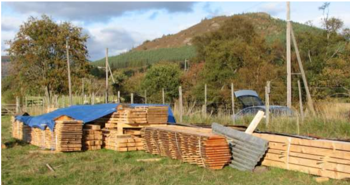
Figure 14. Sawn baulks of timber from the cleared trees.

The stand of Douglas Fir and Spruce that had enclosed the site for 60 years had become unstable and subject to windblow, and was felled. The timber was of good quality, and converted to planks and other dimensions with a portable 'Miser Saw' giving some useable timber (Figure 14). There was an aspiration by the client to utilise this material in the repairs to the byre and the construction of a new property close by; unfortunately for reasons relating to building warrant compliance requiring the certification of timber used in construction this proved unfeasible. However, this timber was used for non-structural repairs to the property. The use of local timber in construction is a current issue, and with appropriate grading and certification it is possible, although in this case time and resources did not allow it.