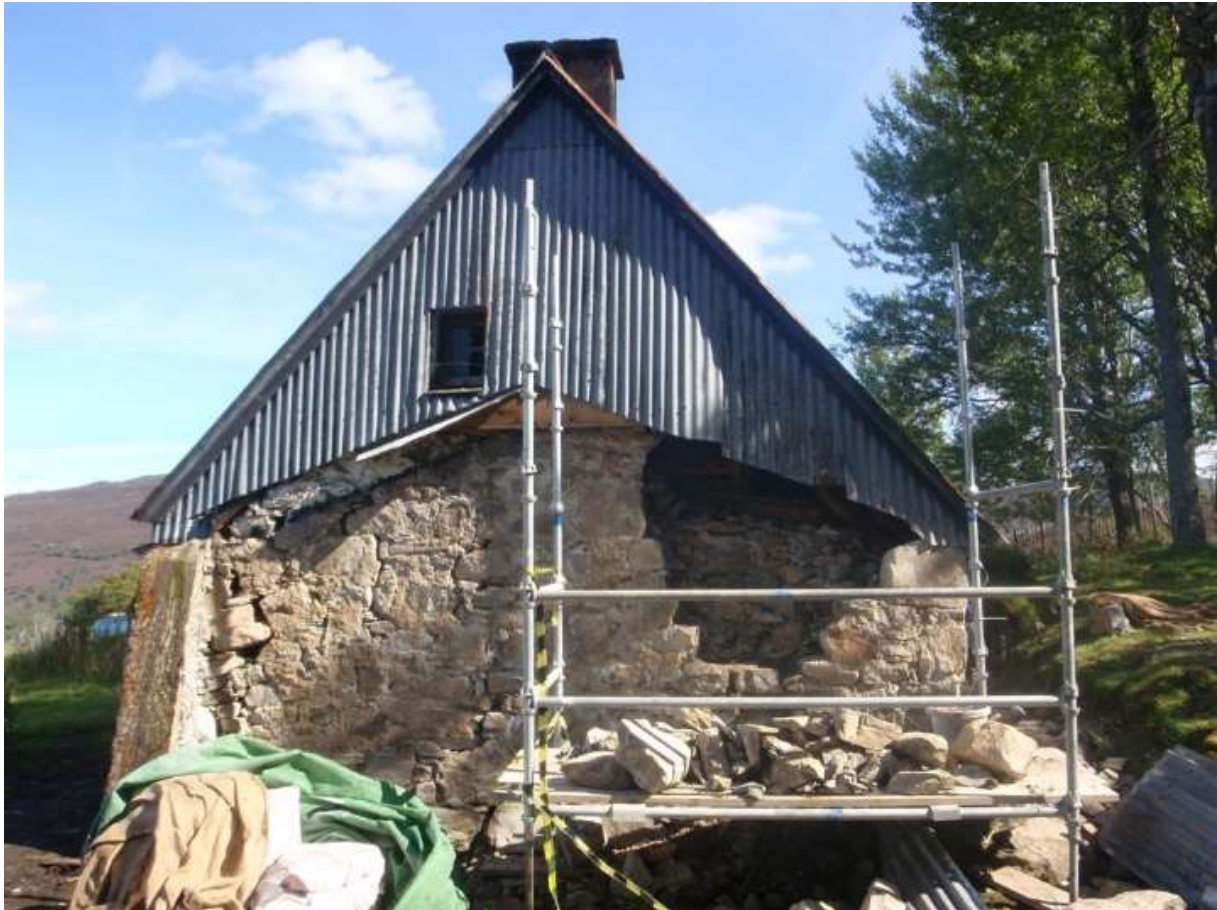
Figure 18. Rebuilding work on the west gable wall in 2013.

from the trees; and on the southwest gable and corner where the bedrock changed to glacial gravel resulting in a poor foundation. Half of the rear wall was rebuilt with salvaged stones and a lime mortar. While at first sight in satisfactory condition, the west gable was not stable, and previous buttressing indicated that there had been problems here for some time. The gable end was dismantled and rebuilt (Figure 18), including the existing flue. Other areas of the masonry walls were repointed with a hot lime mix, and finished with limewash.