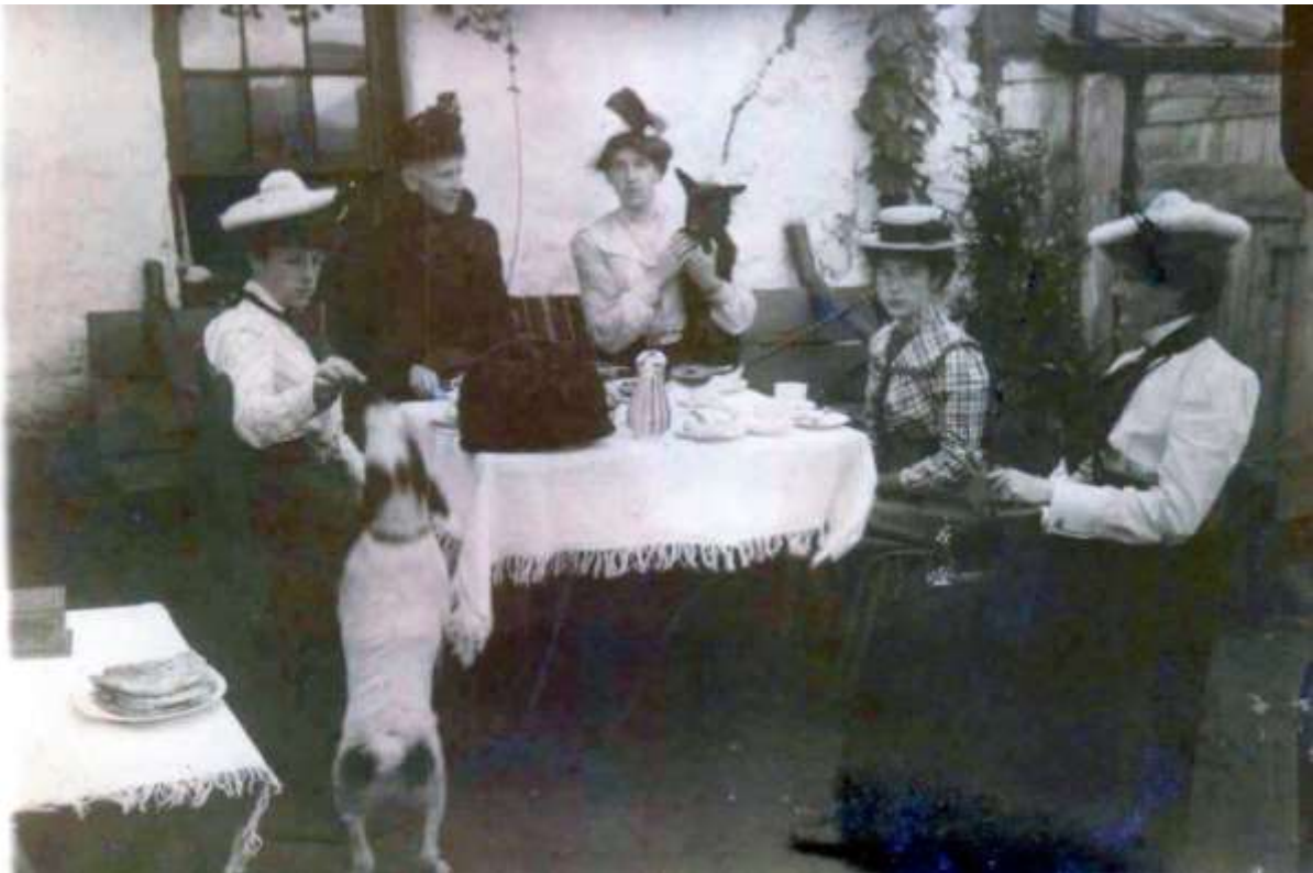
Tea party at the cottage, late-19 th century.