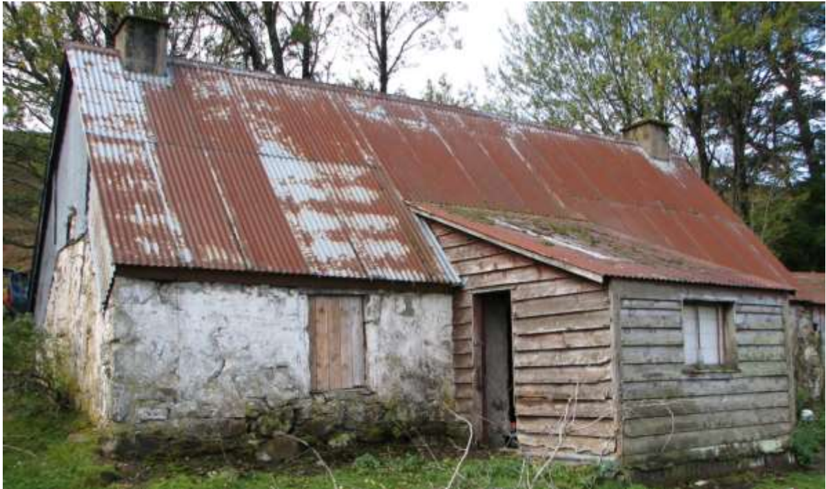
Figure 4. The Croft house in 2011 prior to the refurbishment. The corrugated iron roof covering is of relatively recent date but has largely ensured the survival of the building and the heather thatch beneath.

The corrugated iron would appear to be of a relatively recent date but this additional protection for the thatch was preceded by another protective layer - horizontally laid timber planks, shown clearly in an early image (Figure 5). Interestingly, these planks seem to have also been covered with a form of material, possibly a tar or bitumen painted canvas.