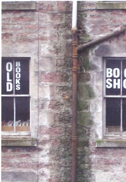
Defective rainwater goods can cause moisture ingress leading to damp conditions ideal for rot

Proper ventilation of areas susceptible to damp or moisture penetration such as cellars, solum (the area underneath a floor) or voids in walls.