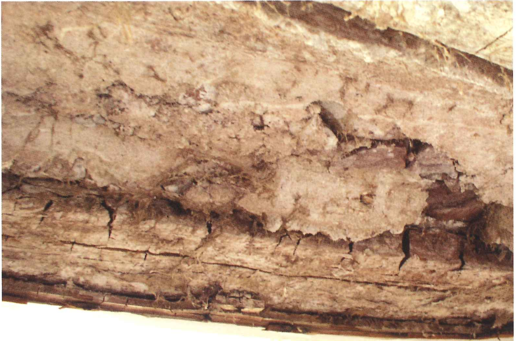
Cuboidal cracking caused by dry rot