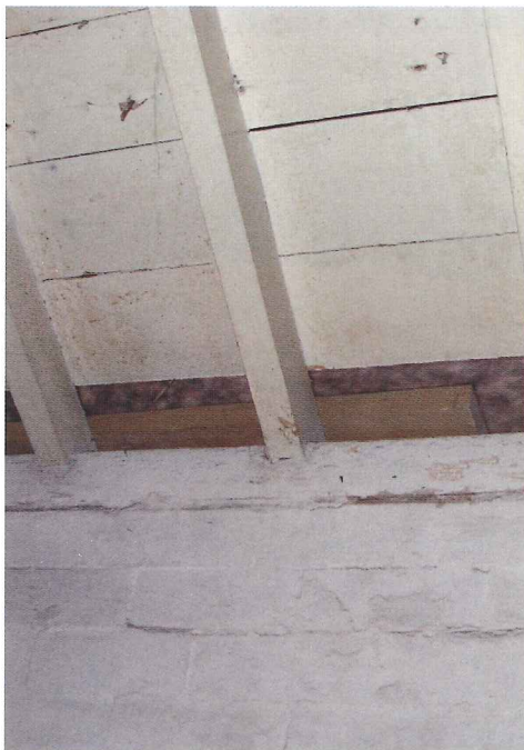
Brown discoloration showing the presence of wet rot