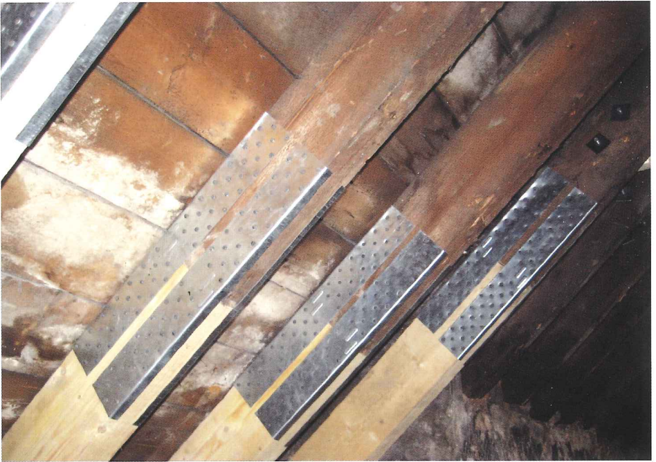
Timbers replaced following an outbreak of rot