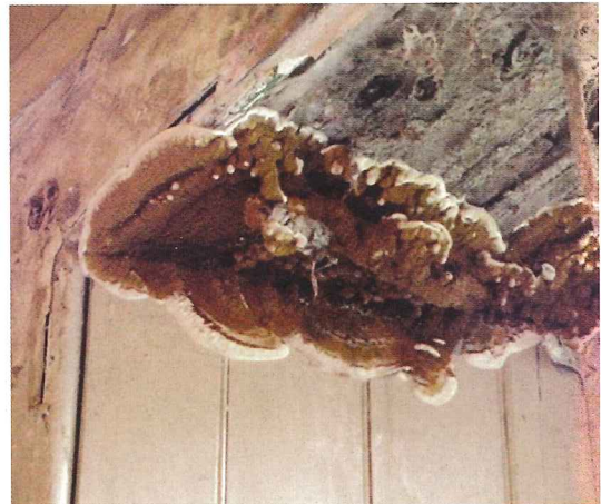
The fruiting body of the dry rot fungus City of Edinburgh Council

Once a rot fungus is established in timber it can spread and grow throughout the wood as long as the conditions remain conducive. In suitably damp conditions dry rot can spread over inorganic substrates such as brick work and plaster to infect other timbers. It is important to note that when conditions change for example the moisture source is removed or the food source exhausted, rot will stop spreading and die off. The final stage of the spread of rot is when the fungus develops what is known as a fruit body which is a large fleshy body commonly bracket like in shape. This releases spores into the atmosphere to spread the rot further.