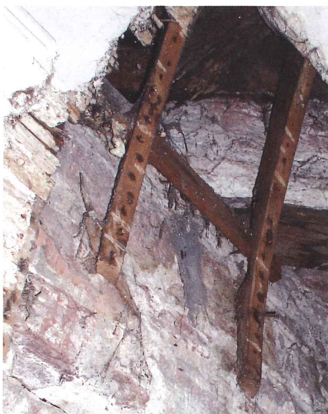
Sensitive installation is needed to avoid unnecessary damage as above

Once rot has established itself in wood it is important to treat it as early as possible. The most effective solution to curing any problem with rot in historic timbers is to remove the source of moisture which created the conditions for the rot to develop in the first place. The process of drying an area of a building could take some considerable time, however, and there are a number of short term measures which can be used to prevent the spread of rot whilst this drying process is taking place.