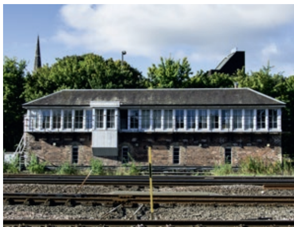
top Stirling middle signal box above Stirling north signal box