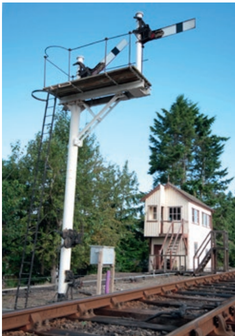
above Semaphore signals beside the Boat of Garten North signal box

Signal boxes are usually two-level structures with a glazed upper section as the operating floor and a room below which houses the interlocking mechanism, the signal wire wheels and the point drive cranks. The key piece of equipment – the lever frame – works the points on the track where rails intersect, as well as a series of ‘stop and go’ semaphore or, more recently, coloured light signals to be observed and acted upon by train drivers. The levers are mechanically interlocked against each other to provide safe and seamless operation by the signalman who can also observe the position of the trains through the windows of the signal box. That these buildings have continued to operate, relatively unchanged, for well over one hundred years is testament to the success of the basic design.