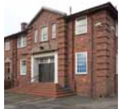
Central Avenue, Richard Greenhow Centre, former Institute