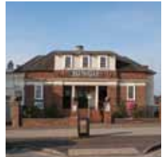
Former cinema, Central Avenue

Reproduced by permission of Ordnance Survey on behalf of HMSO. (c) Crown copyright and database right [2012]. All rights reserved. Ordnance Survey Licence number 100017509.