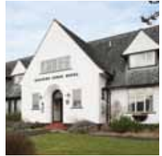
Hunters Lodge Hotel, former Staff Club