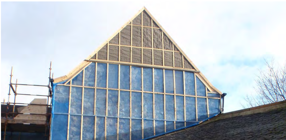
Figure 6. The completed work to the gable end of the west wing, showing the temporary roof covering, the vertical cladding and the netting protection.

The gable end where the chimney had been removed was overclad with vertical timber sheeting covered with roofing felt. The lower part of the gable was covered with netting on a wooden framework to prevent any fall of masonry (Figure 6). Limited mortar repairs were carried out on masonry around the flue area. On the rear elevation the brick chimney stack was taken down, and the dormer window in the attic was reinforced with particle board. The work to these areas progressed as planned and the time taken and materials used were within budget.