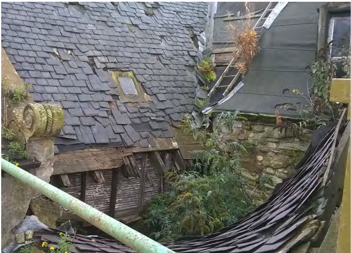
Figure 10. The void where the hall roof had been. The condition of near collapse of adjacent roofs is very obvious in this image taken from the corner of the east range.

A flat roof to replace the fallen one was required, both for access to the adjacent north pitch of the stair and to provide a covering to the hall/porch that the building had not had for many years. It was agreed that a new flat