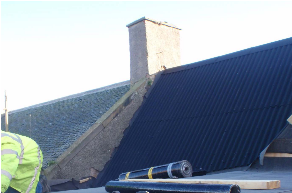
Figure 12. The new roof covering to the stairwell roof, viewed from the new tower roof. The slated pitch of the east wing to the left was not part of the works.

lacked for decades (Figure 12). This protection will allow the fabric at the centre of the house to gradually dry out.