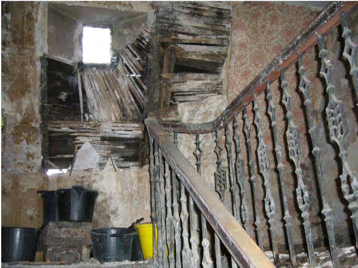
Figure 3. The decay evident in the stairwell resulting from longstanding water penetration due to a complex roof plan and drainage arrangements. The timber half landing on which the buckets sit is entirely decayed and unsafe.

generally better condition with a sound roof, albeit with some missing roof slates.