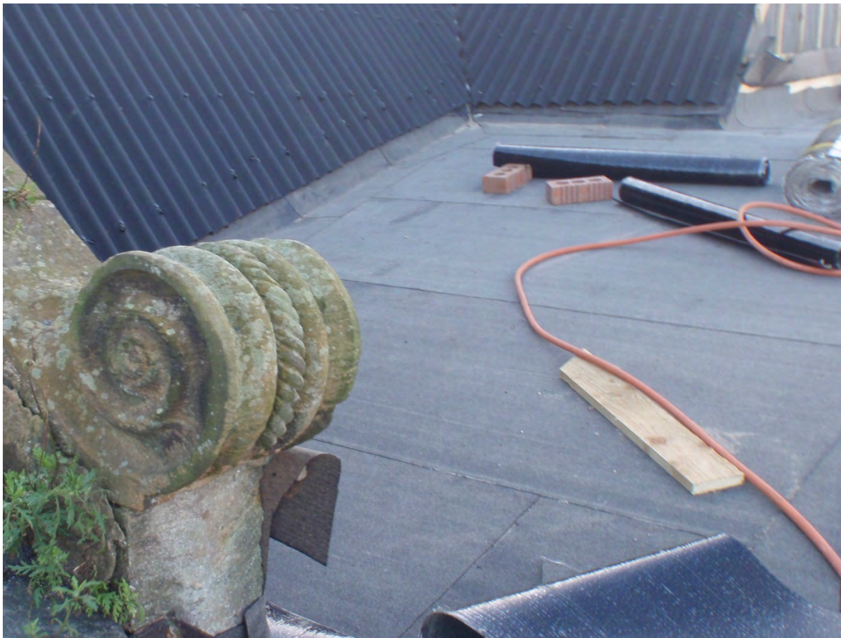
Figure 11. The new flat roof over the hall, which provided access to work on the stairwell roof. The re-covered north pitch of the stairwell roof can also be seen top right.

roof over the hall was desirable to largely complete the temporary roof covering over the core of the building. However, this work was not part of the Dangerous Building Notice and so required additional funds. Funds were re-allocated from savings made by not having to apply torch-on felt to the ogee roof. By working carefully from the scaffold, the contractor was able to extend new timber joists of standard dimension over the void where the hall roof had been. Particle board was then fastened over the joists and covered with a torch-on mineral felt. The new flat roof was given a run to the garden on the east side (Figure 11) to shed water away from this vulnerable area of the building.