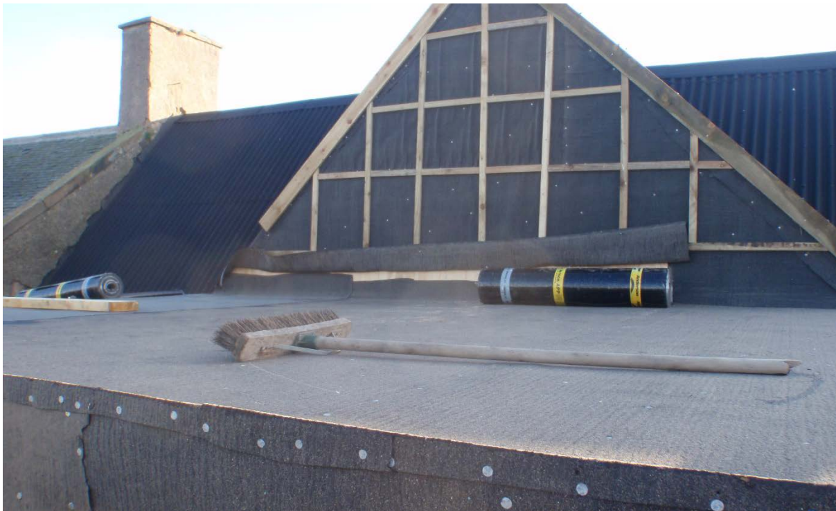
Figure 8. The new flat roof over the tower, with a run or angle to the right to shed water. The covering to the joining roof pitch can be seen behind, with the new temporary roof over the central part of the building behind.

compromising the interior and increasing the chance of decay and collapse. Therefore, the difficult decision was made to dismantle the ogee roof entirely and replace it with a flat felt-covered roof to protect the tower masonry and the fragile interiors below. This was completed with roofing felt and timber battens (Figure 8). A run on the new flat roof over the tower drains water away from the pavement, and an alternative route for the water over the former hall area was identified. Although the complete removal of the roof was not an ideal end-point in conservation terms, it was considered the best solution in the circumstances in order to safeguard the remaining building structure.