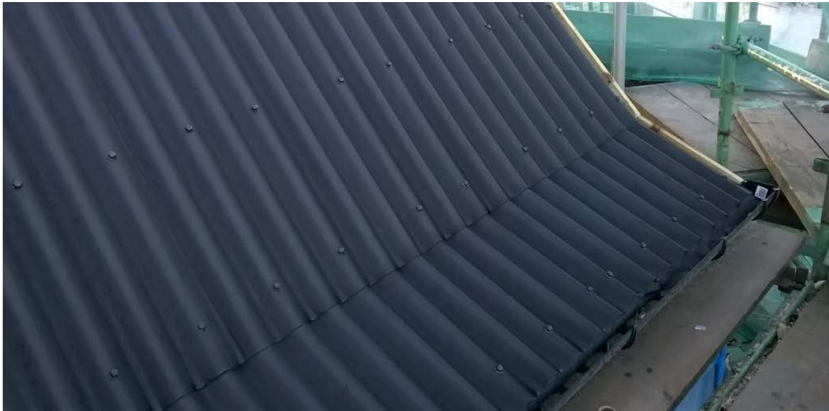
Figure 5. The new corrugated sheet roof covering to the west wing roof, laid over the existing rafters and sarking.

lightweight profiled roofing sheet was fastened down with screw fixings (Figure 5).