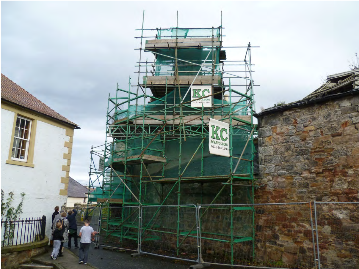
Figure 4. The protective scaffold put up on the west gable. This resulted in closure of the road.

East Lothian Council concluded that Harlawhill House was a danger to the public and issued the owner with a Dangerous Building Notice. A Dangerous Building Notice – under the Building (Scotland) Act 2003 – prescribes the steps that a local authority considers must be taken by a property owner to reduce or remove danger to the public. It will also specify the date by which the works must start and be completed. It cannot specify more than to make the building safe. Therefore, in the case of Harlawhill House, it did not require the total demolition of the building, as only the western end was deemed to constitute a public danger. If an owner is unwilling, or unable, to undertake the works, a local authority can carry out those works and claim back from the owner the costs involved. Due to the potential complexities resulting from serving a Dangerous Building Notice, it is typically used by local authorities sparingly and as a last resort.