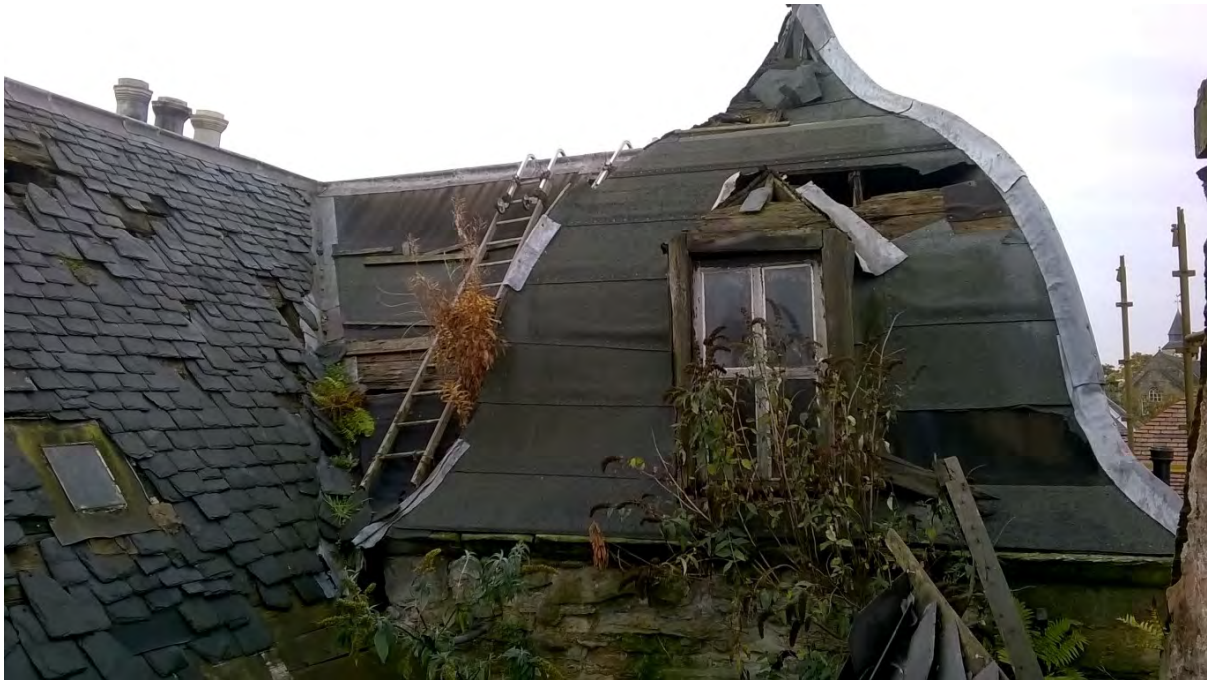
Figure 7. The tower roof viewed from the east side. The extensive decay and loss of the structural timber on this pitch, combined with lack of access into the roof space below, meant that removal was the only option.

The focus of the works then moved to the tower and the areas of roof over the hall and stairwell. On closer inspection the tower roof turned out to be extensively decayed structurally on the east side due to significant water ingress and consequent timber decay (Figure 7). This situation could only be appreciated once the slates had been removed, exposing a structure much less sound than expected. The existing roofing felt had been letting in water for many years and the roof timbers and sarking were nearly all rotted through with no strength for the planned torch-on felt.