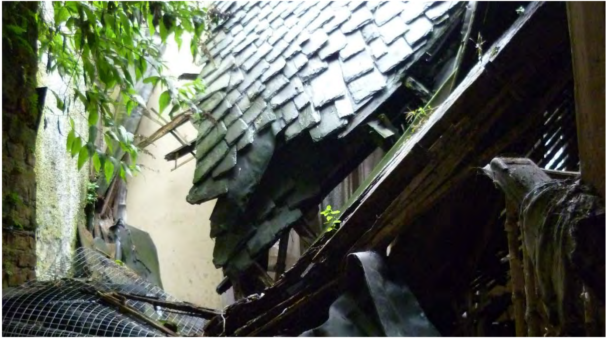
Figure 9. The remains of the collapsed hall roof viewed from the stairwell. The handrail of the stairwell balustrade can be seen far right.