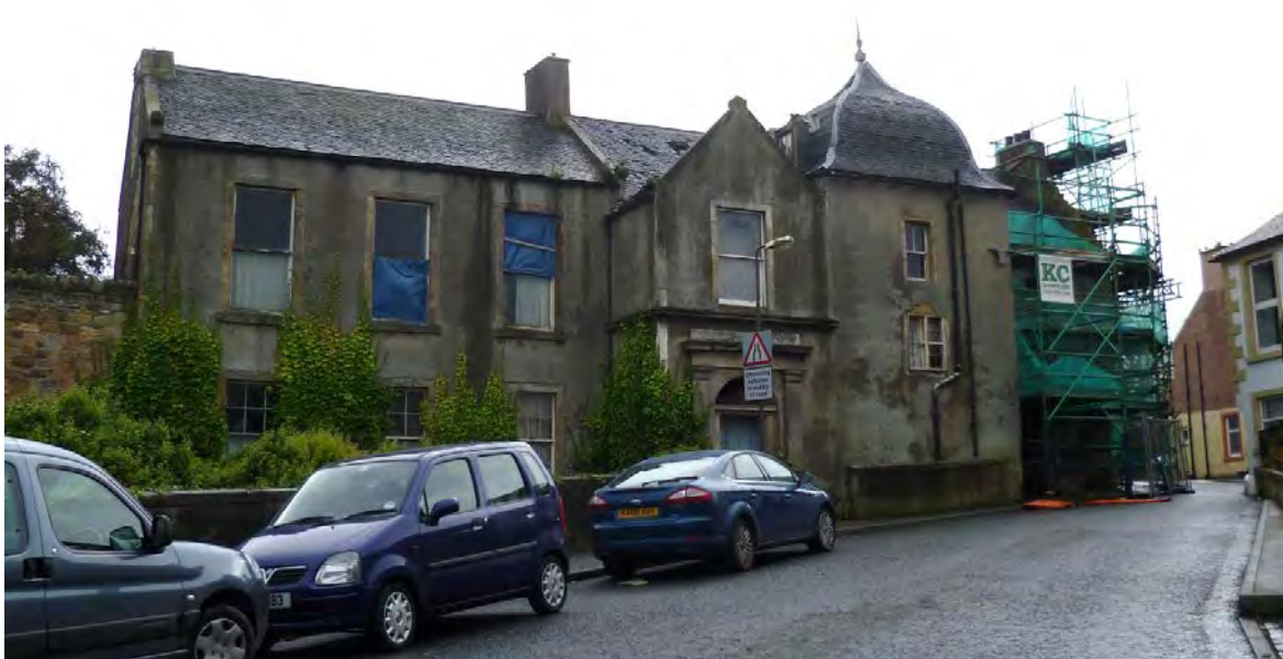
Figure 1. Harlawhill House viewed from the north in 2014 with the early 19th-century east wing and gabled two-storey entrance porch. The distinctive 17th-century ogee roofed tower sits adjacent to the porch.

Harlawhill House is located in the centre of the village of Prestonpans in East Lothian, Scotland. The west gable adjoins the street of Harlaw Hill with a small garden area to the front, and more substantial grounds to the rear enclosed by masonry walls (Figure 1). Harlawhill House is recognised to be of national significance through its Category A Listed status.