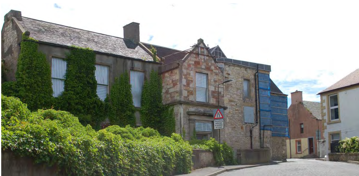
Figure 13. Harlawhill house at the end of the interim works. The appearance of the building has changed, but it is now secure and dry for the first time in many decades.